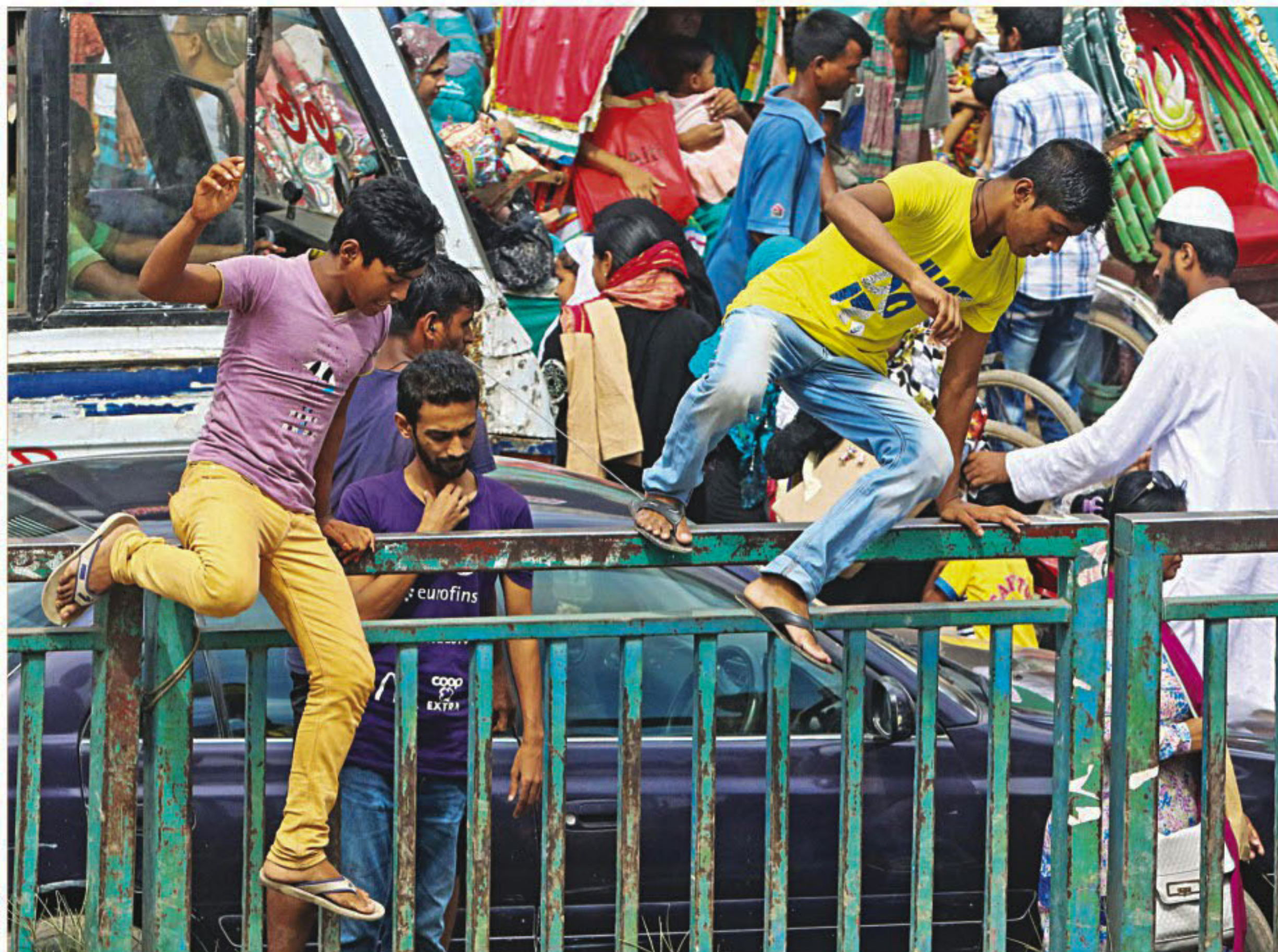
Pedestrians risk their lives and that of others jumping over the railing dividing the traffic-filled road before New Market in the capital despite the presence of a footbridge just metres away. The photo was taken on Friday.

He will be buried at the Banani Army graveyard in the capital. He died on July 8 at a USA hospital, aged 76.