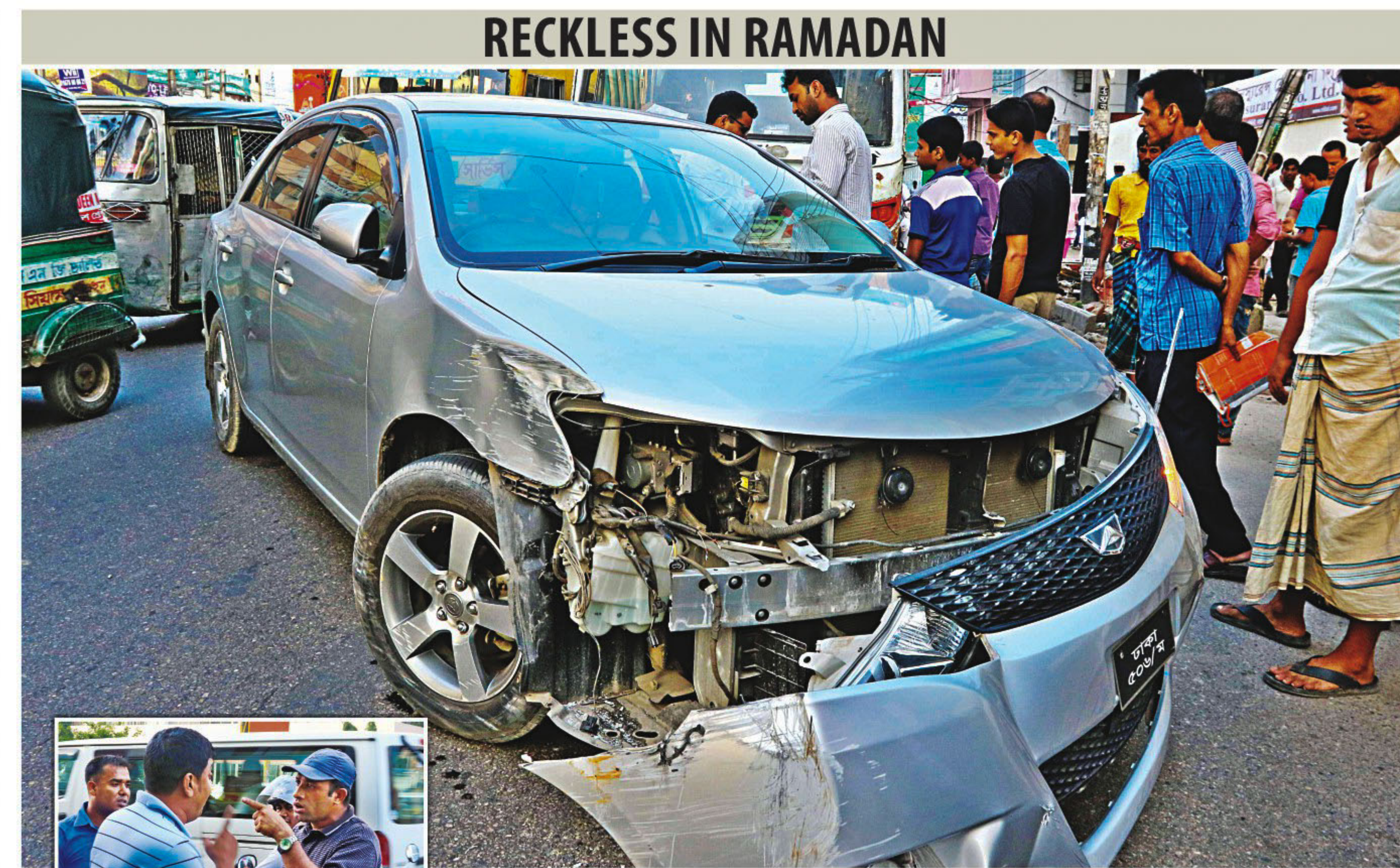
The bumper of an official car of the Prime Minister's Office got dislodged after a speeding bus of Shikar Paribahan hit it side-on in front of Star Restaurant and Hotel on the capital's Kazi Nazrul Islam Avenue around 6:00pm yesterday. Inset, a few metres away and at the same time, a private car owner, left, and a motorcyclist lock horns after a minor collision during parking of their vehicles.