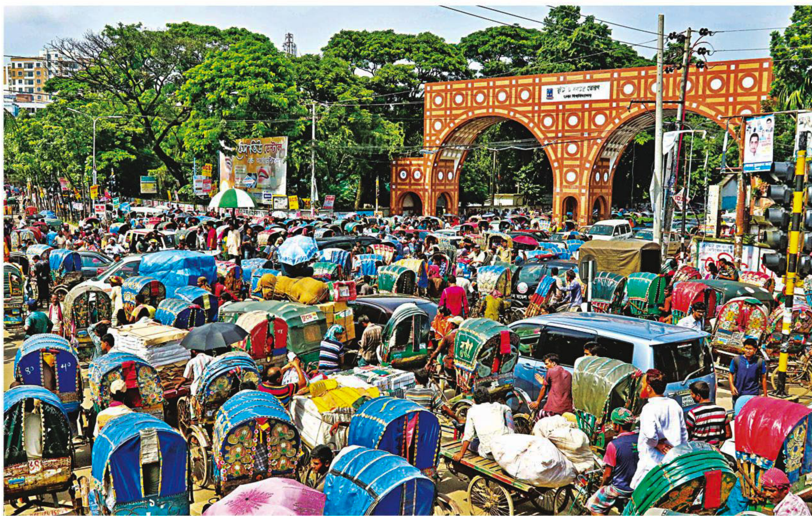
Traffic chaos in the capital's Nilkhet area. Hundreds of vehicles remain stuck at the Nilkhet intersection for hours, as shoppers in droves swarm the nearby Gausia Market and New Market. This photo was taken yesterday noon.