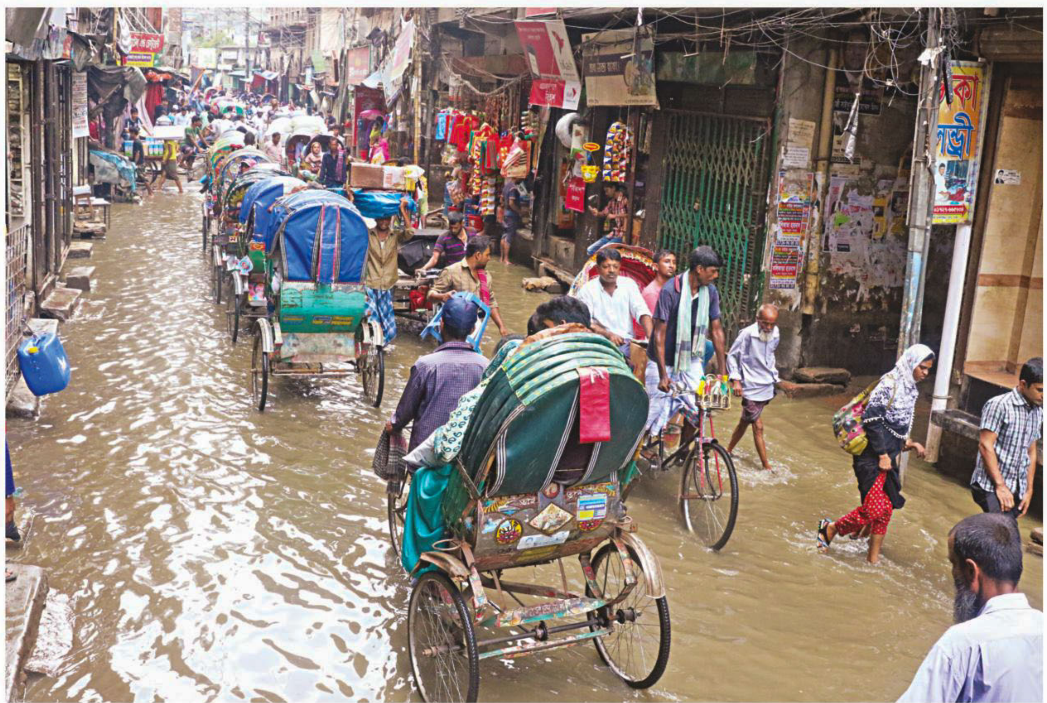
Poor drainage system leaves this stretch of Kazi Alauddin Road in Old Dhaka waterlogged even though it didn't rain in the area yesterday. Pedestrians are left with no choice but to wade through stinky ankle-deep water. This photo was taken yesterday afternoon.

"If it was something not normal or suspicious then it would have gone through my head but there was nothing. No signs. If there was a sign I would have picked up on it."