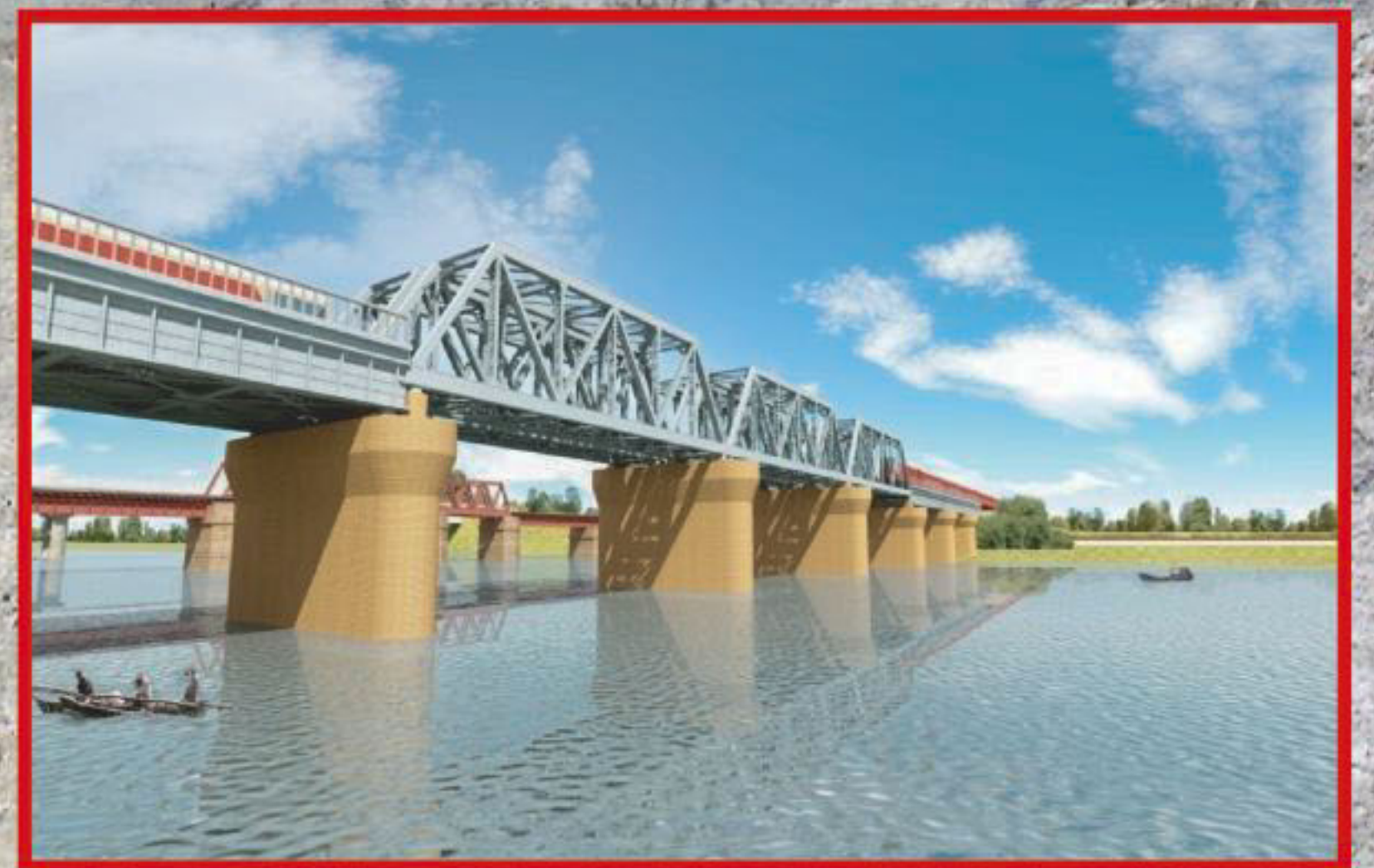
দ্বিতীয় ভৈরব রেলওয়ে ব্রিজ