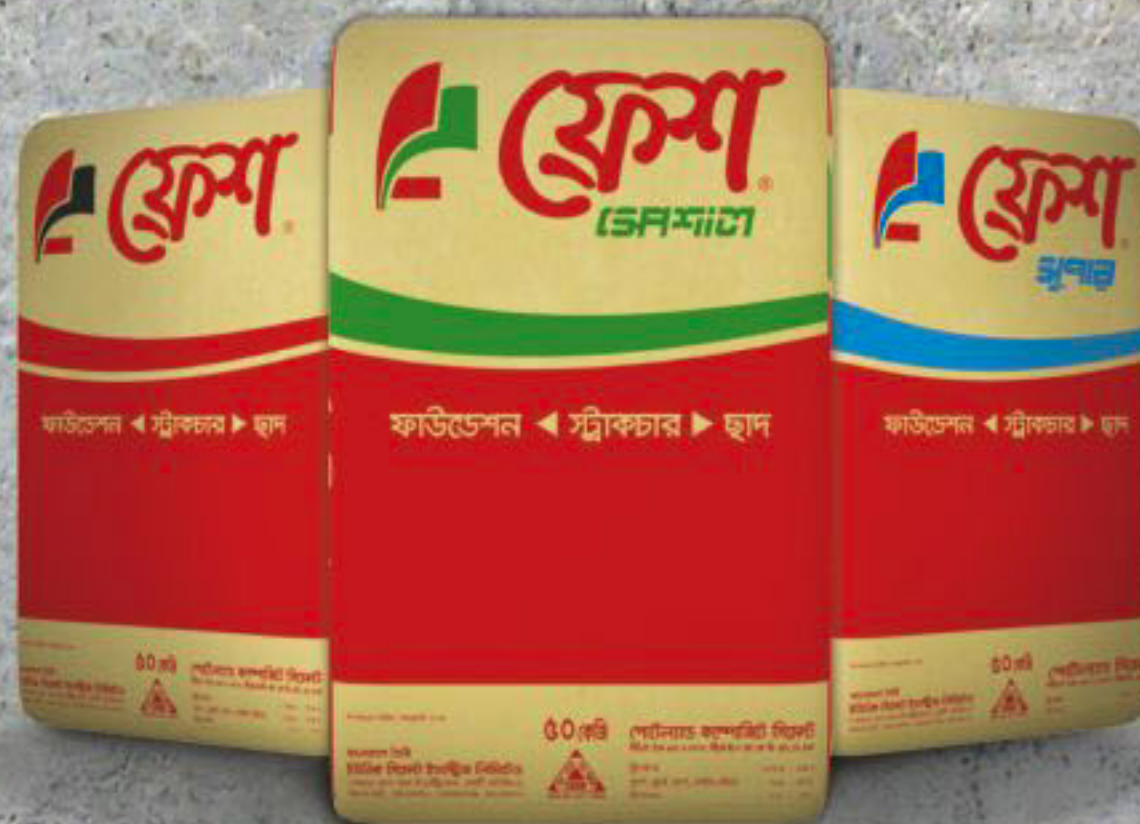
ফ্রেশ সিমেন্ট মানে হাই পারফরমেন্স সিমেন্ট

ফ্রেশ সিমেন্ট ব্যবহৃত হচ্ছে দেশের সকল বৃহৎ স্থাপনায়!