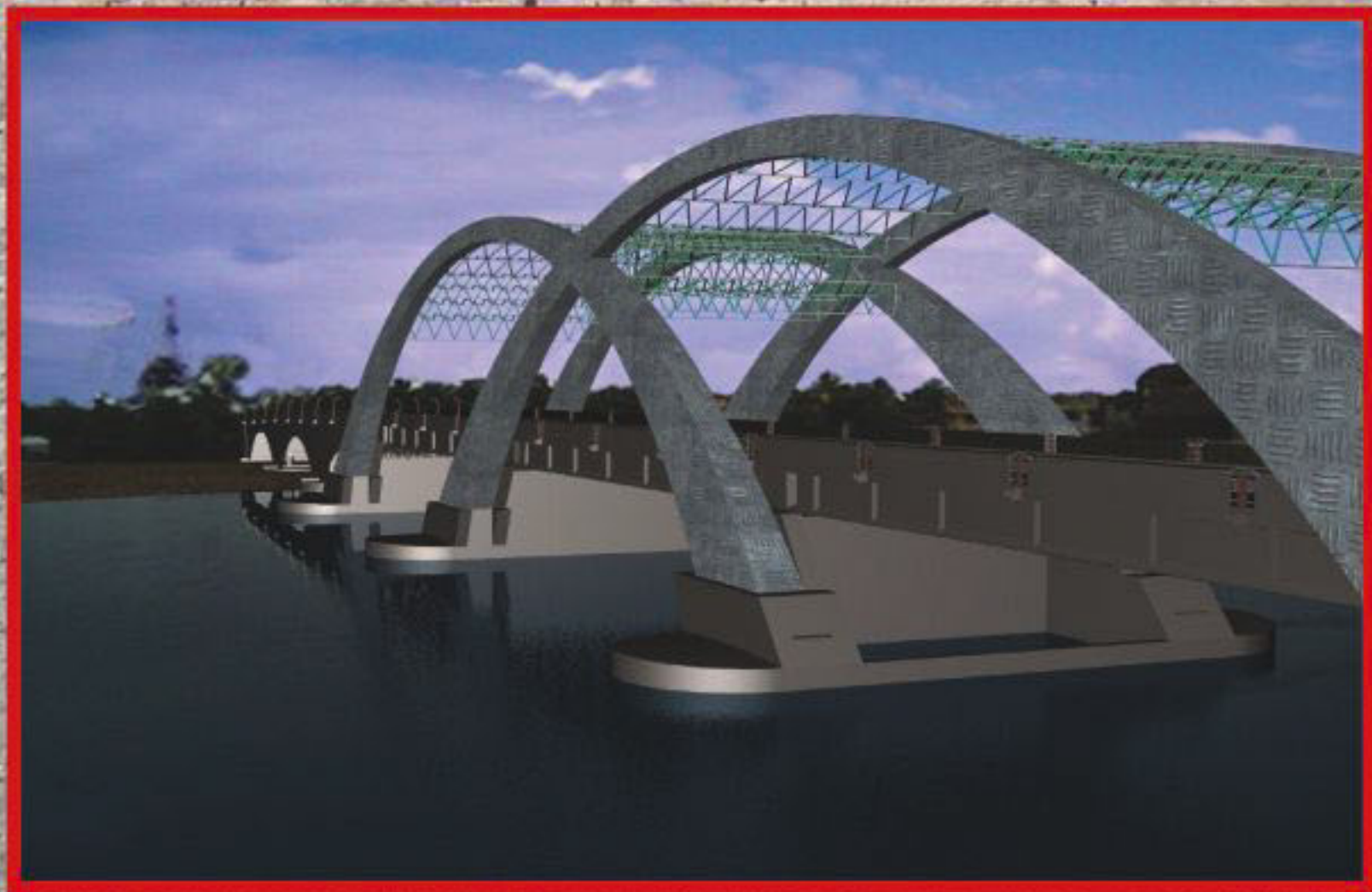
কাজির বাজার ব্রিজ, সিলেট