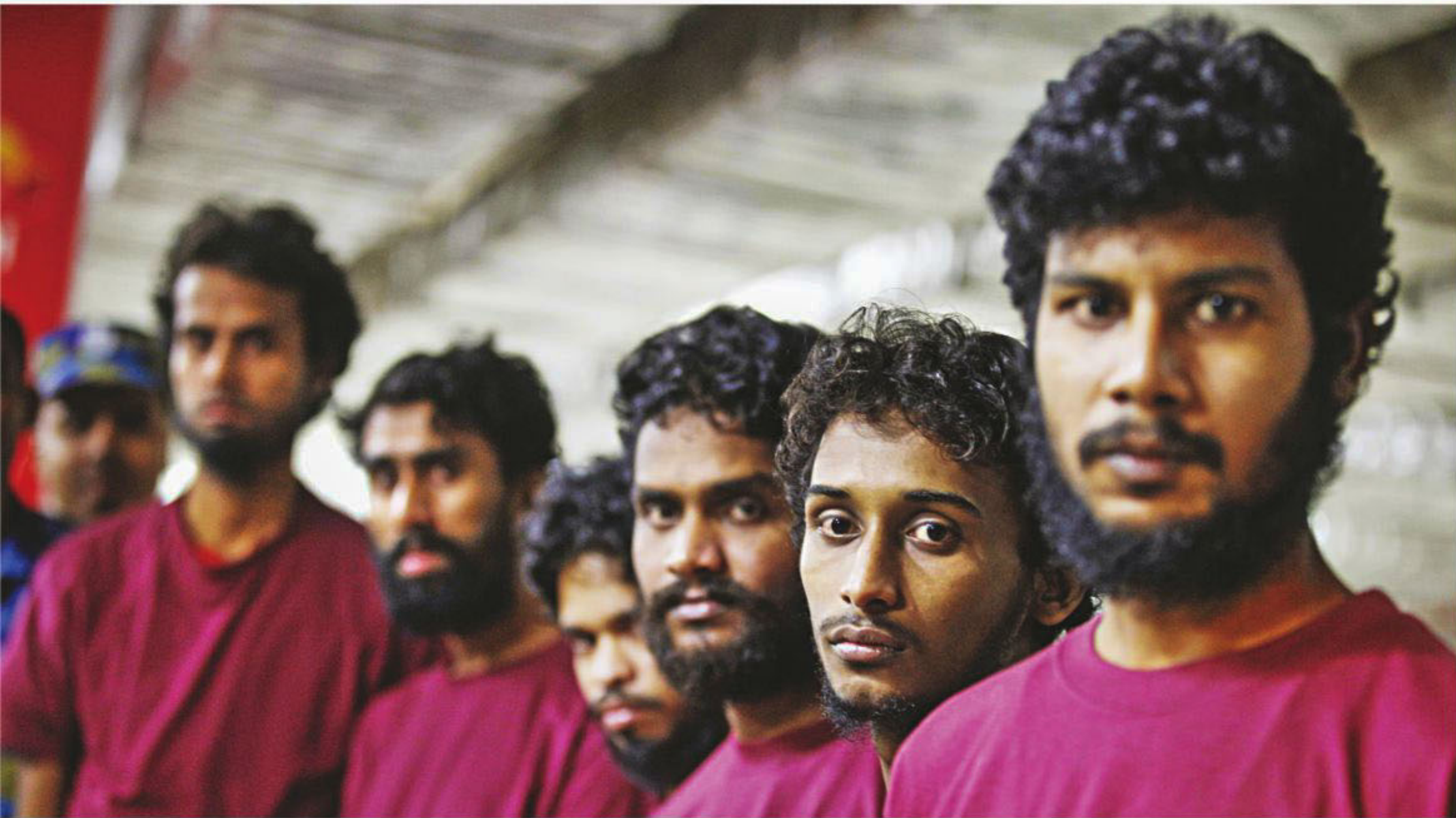
Some of the 95 trafficking victims, who were rescued by Malaysian authorities, return home on a Biman Bangladesh Airlines flight from Malaysia Thursday afternoon.