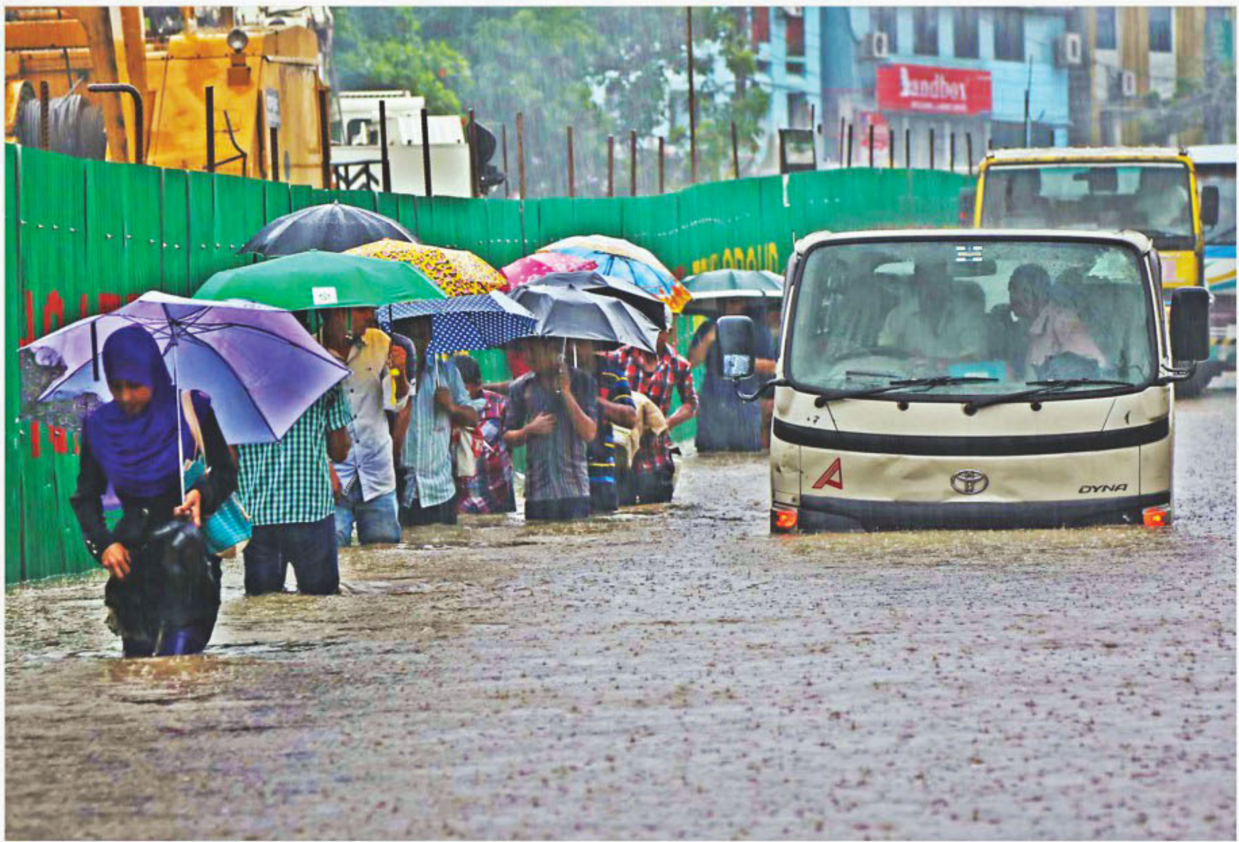
People holding umbrellas wade through over knee-deep water with a pickup truck stuck in the middle of the street at Sholoshahar in Chittagong city following an early morning downpour yesterday.

STAFF CORRESPONDENT A low-cost oral cholera vaccine can substantially reduce cases of the deadly disease, according to a recent study conducted in Bangladesh. The vaccine, called Shanchol, can greatly contribute to cholera control efforts in the countries where the disease is endemic, says the icddr, b that conducted the study in the vast slums of Dhaka. The vaccine costs only Tk 144 or $1.85 per dose and has been prequalified for vaccination programmes by the World Health Organisation as it was proven to be safe and effective in field trials. The incidence of cholera decreased by more than 50 percent among those who were vaccinated with Shanchol, according to the findings published in The Lancet, a UK medical journal. The study -- funded by Bill & Melinda Gates Foundation and conducted in collaboration with the health and family welfare ministry of Bangladesh -- was the first effort to give Shanchol through a routine government healthcare to an urban population in constant danger of contracting the disease. Cholera takes a tremendous toll on public health globally with 91,000 people dying every year, most of them