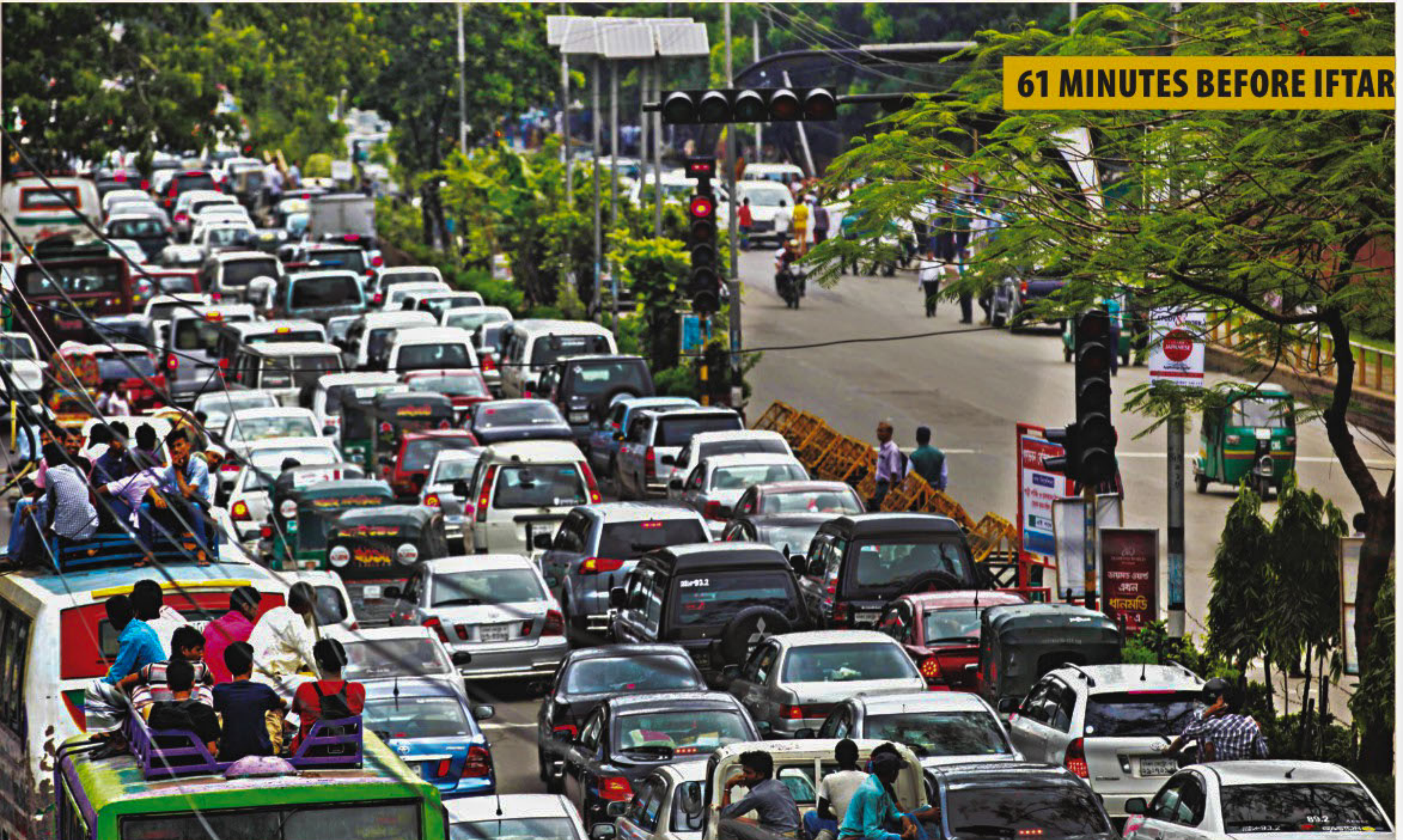
The Mirpur Road near Gono Bhaban is packed with vehicles sitting idle in stand-still traffic just an hour before iftar. Many missed iftar at home due to poor traffic management and the lack of prior notice of traffic diversions and street closures. More photos on page 2.