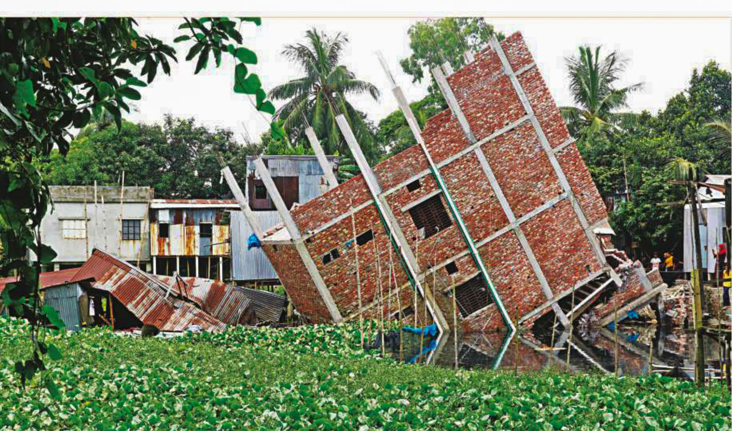
An under-construction four-storey building tumbled onto three nearby shanties at Shuvaddha jheel in Dhaka's South Keraniganj on Monday night. Residents of the shanties, which sank in the water body, escaped harm. Police suspect that the building owner did not have proper foundation. The photo was taken yesterday.