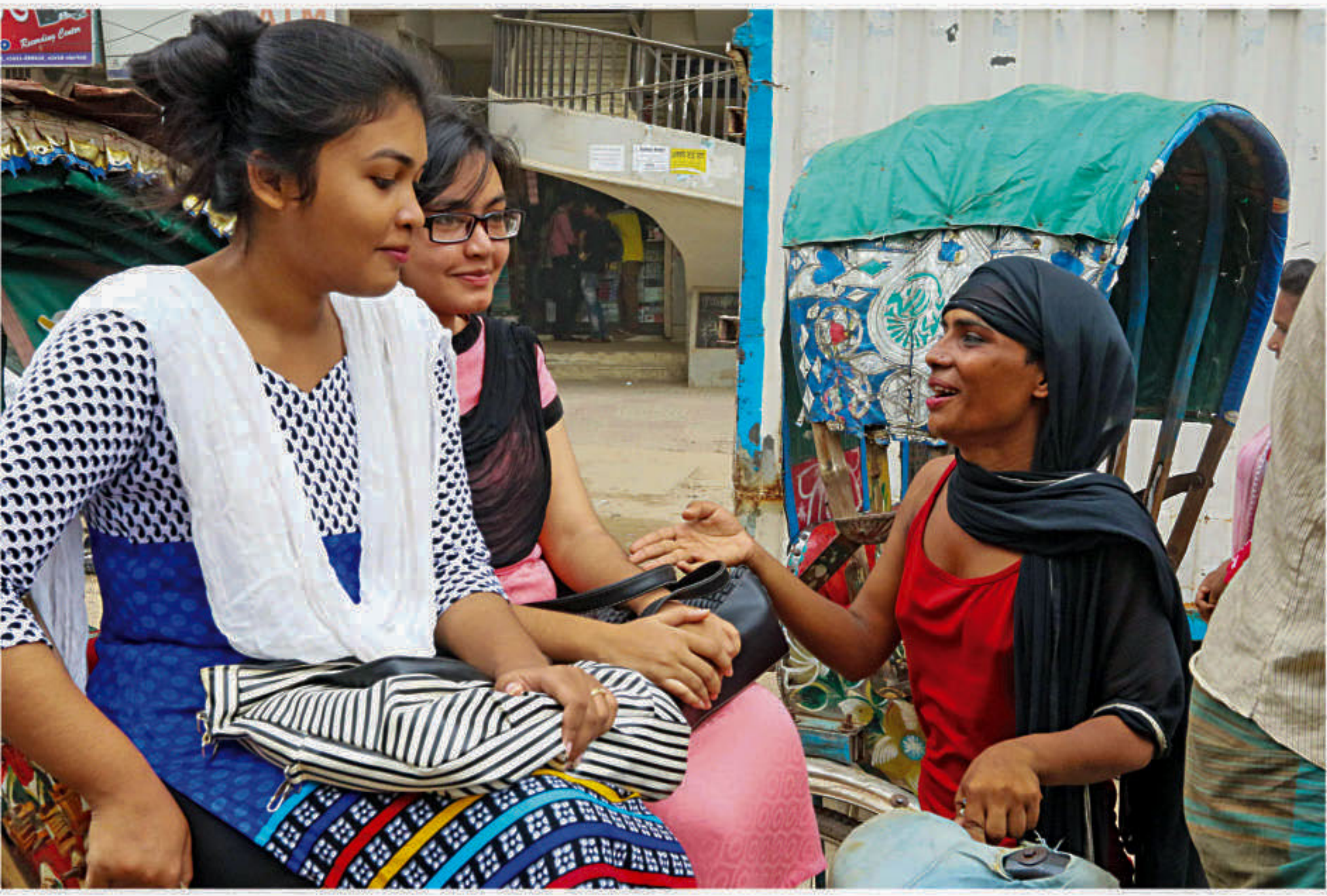
With the Eid-ul-Fitr just over a week away, hundreds of beggars are in the capital, hoping to get zakat and fitra from the city dwellers. At this time of the year, people tend to be generous with bonuses in pockets and their businesses doing well. In these photos taken yesterday, some hijras (hermaphrodites) are seen asking rickshaw passengers for money near the Mouchak Market.