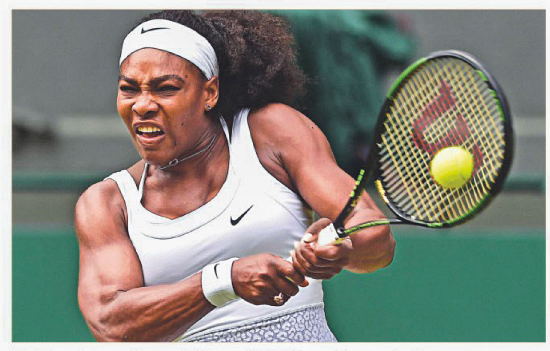
World number one Serena Williams of USA hits a return against her sister Venus Williams during their women's singles fourth round match in Wimbledon yesterday.