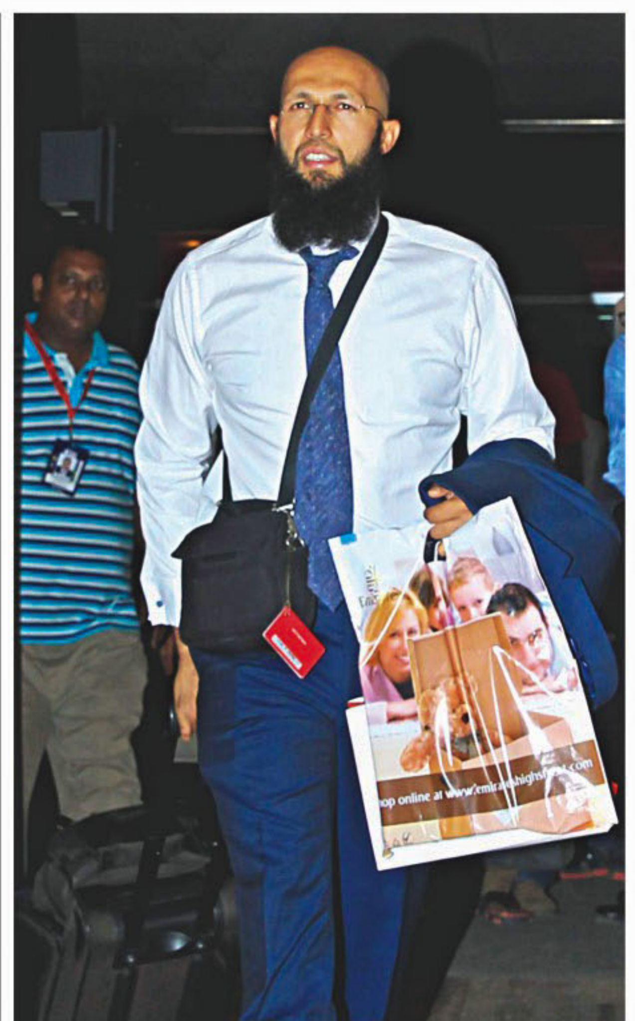
South Africa's ODI opener Hashim Amla and four other players joined the Proteas tour party at the team hotel in Dhaka yesterday evening.

"Our plan was to score 40-50 runs without any wicket in the first six overs. But we lost two quick wickets and never managed to recover from that. Hopefully our plan will work in the next T20I. We need to win that and keep the momentum going into the ODIs," said Soumya.