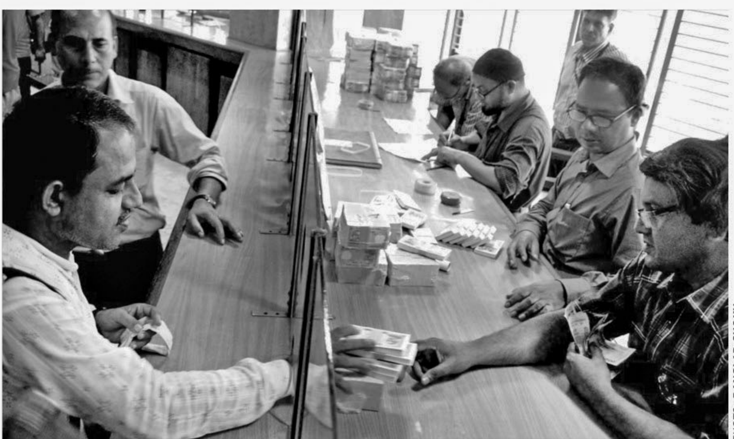
People collect new notes from Bangladesh Bank in the capital yesterday. The central bank released freshly printed notes worth Tk 22,000 crore ahead of Eid-ul-Fitr when new and crispy bills are usually given to children as gift.

Our Narayanganj correspondent adds: the court framed charges against the six in the killing case last year.