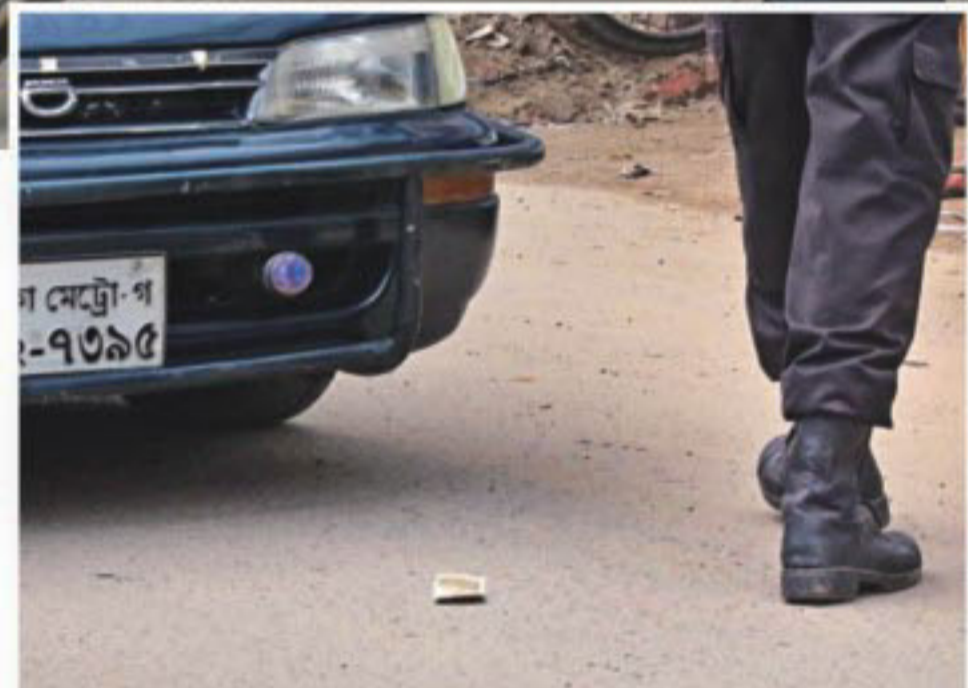
(Anti-clockwise from top) A Bangladesh Ansar member working with traffic police midway through New Eskaton Road in the capital imposes a selective bar on rickshaws and rickshaw-vans, allowing towards the Banglamotor crossing only those willing to bribe him Tk 5 and Tk 10 respectively. The Ansar member drops a Tk 5 note he just took from a rickshaw-puller on seeing this photojournalist bring out a camera. He then painstakingly tried to nudge the money with his feet to the side of the road before giving up altogether. The photos were taken yesterday.