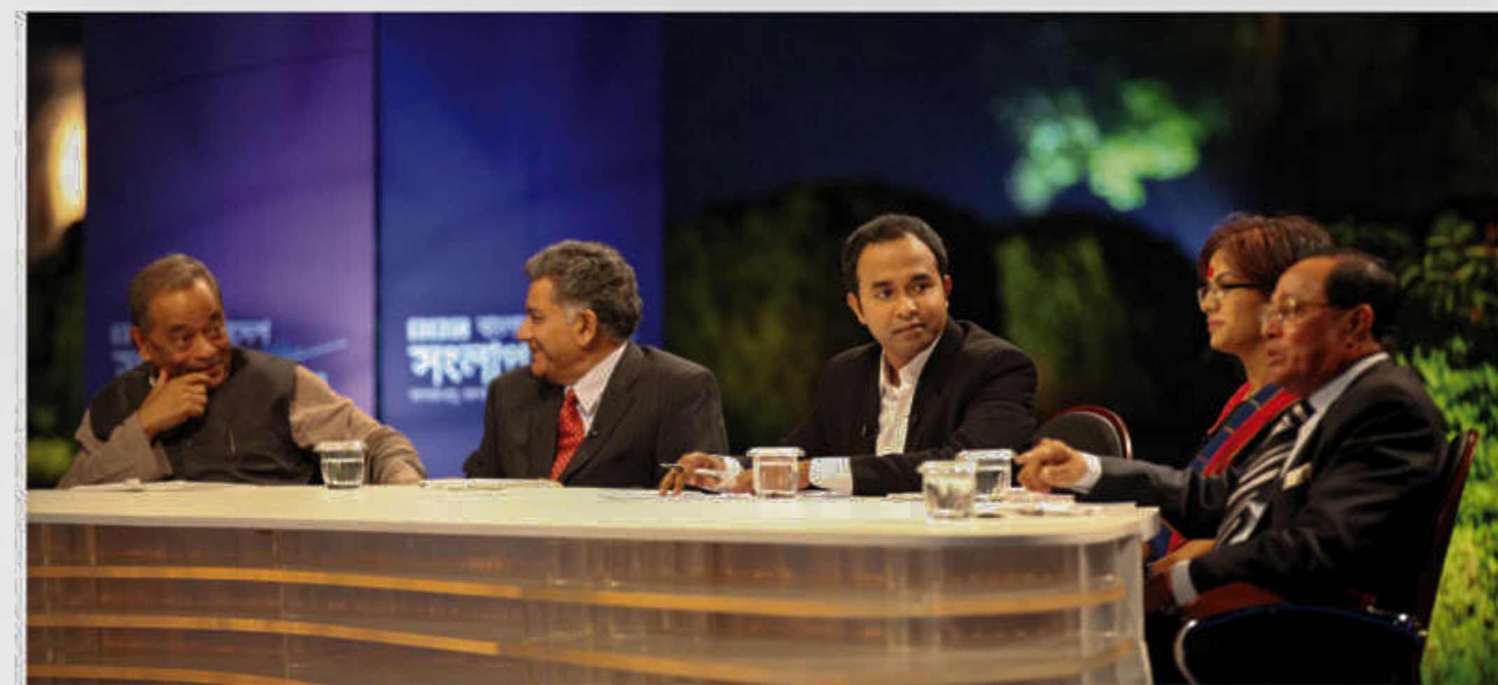
The ongoing ‘BBC Sanglap’.

Besides live audience participation, BBC Sanglap is also credited for reaching out to the people of different parts of Bangladesh. In June 2013, on the eve of the mayoral elections in Khulna, Rajshahi