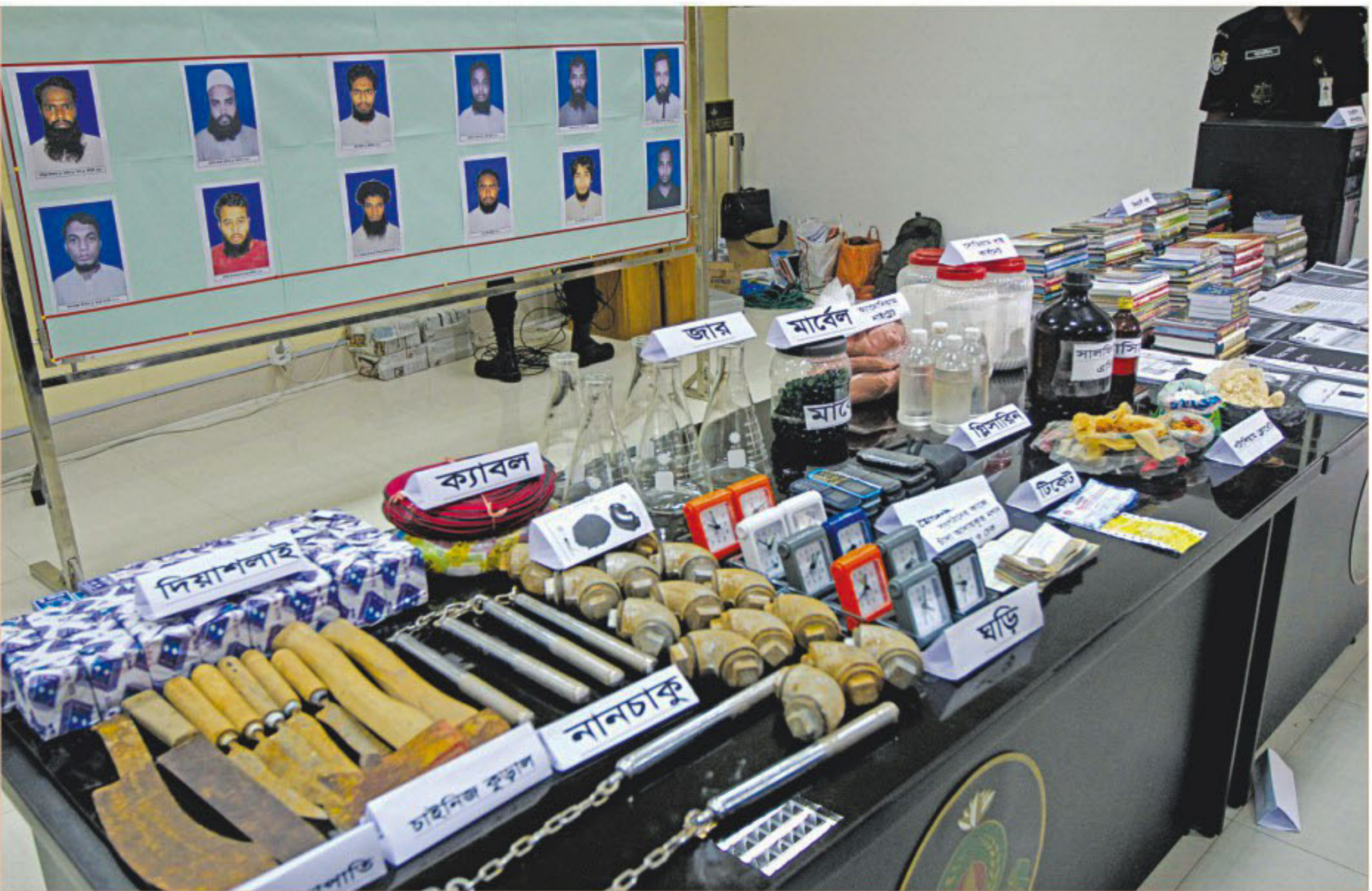
The seized bomb-making materials, sharp weapons and books on jihad on display at the Rab headquarters in Uttara yesterday. The crime busters also arrested 12 alleged Huji members during recent raids in the capital.