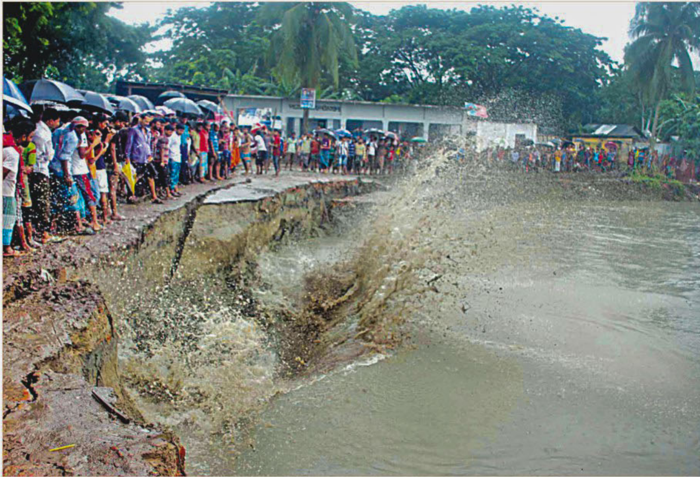
The swelling Kirtankhola devouring its banks at Charkauakheya Ghat of Barisal yesterday. The river has already swallowed some 25 small houses and shops there and is threatening to take in more.

Ransom calls from Thailand to the families of at least SEE PAGE 2 COL 2