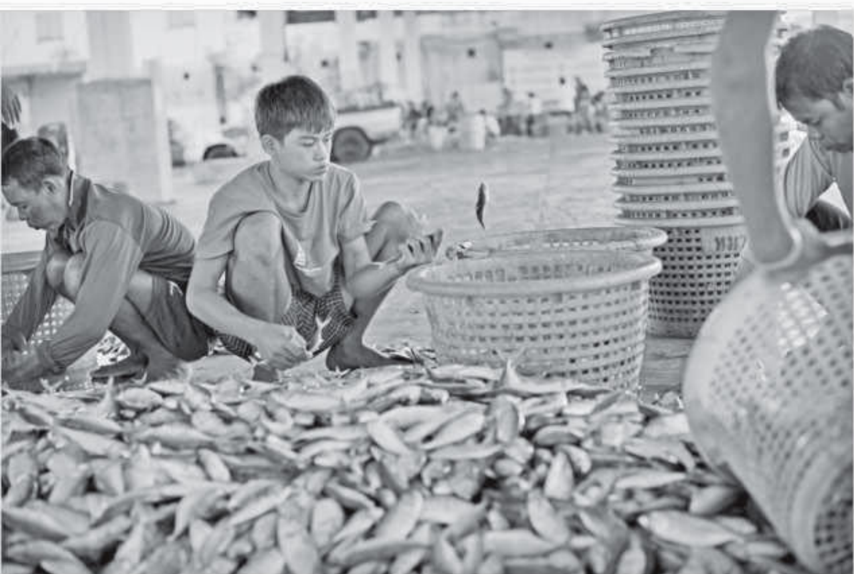
Migrant workers sort out fish in a port in Bangkok.