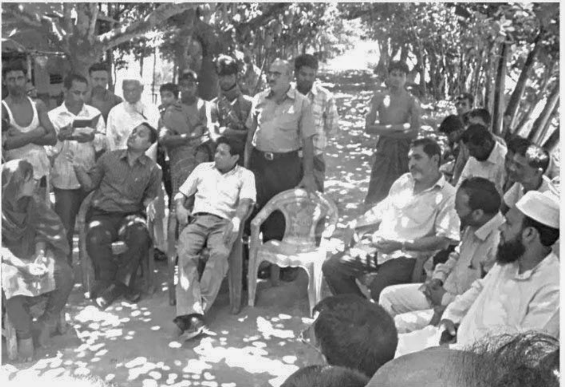
Members of a medical team talk to people at Bulbaria village in Santhia upazila under Pabna district to enquire about the unknown disease that killed four people and affected several others during the last few days.

"Due to mass psychogenic illness, the four died in different times," suspected Dr Anisur Rahman, adding that they are further investigating to find out the reason of the deaths.