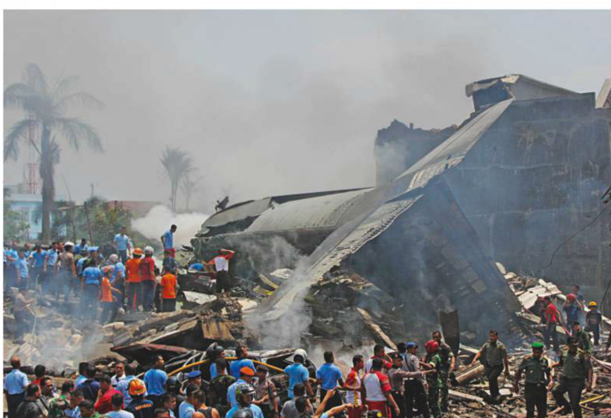
Indonesian rescue personnel work at the scene of an Indonesian military C-130 Hercules aircraft crash in Medan yesterday. The transport plane crashed shortly after take-off in the city on Sumatra island, exploding in a ball of flames in a residential area.