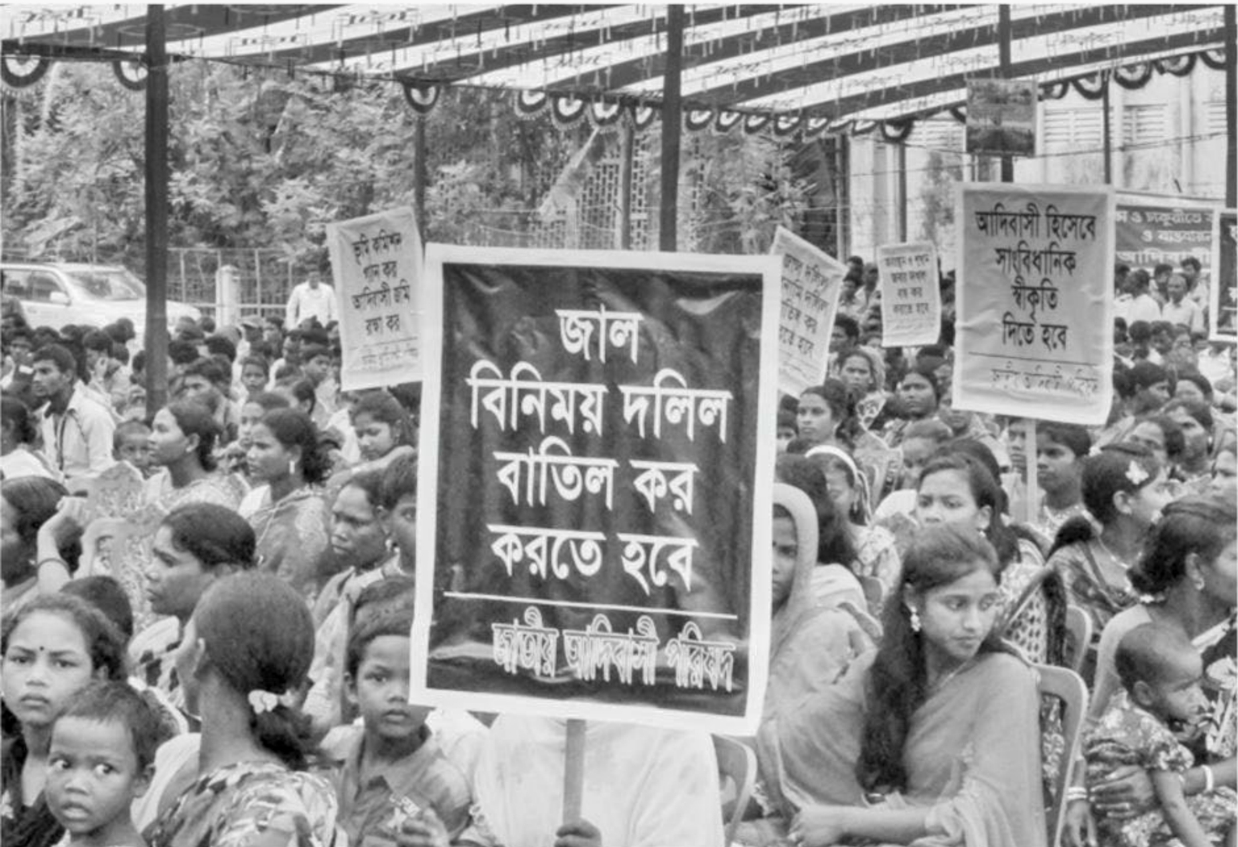
A large number of indigenous people gather on the premises of Dinajpur Institute in the town to join a programme there marking the 160th Santhal Hul yesterday. The ethnic minority people have reiterated the demand for ensuring their safety and right on ancestral lands.

Plain land indigenous people iterate demands at Dinajpur rally