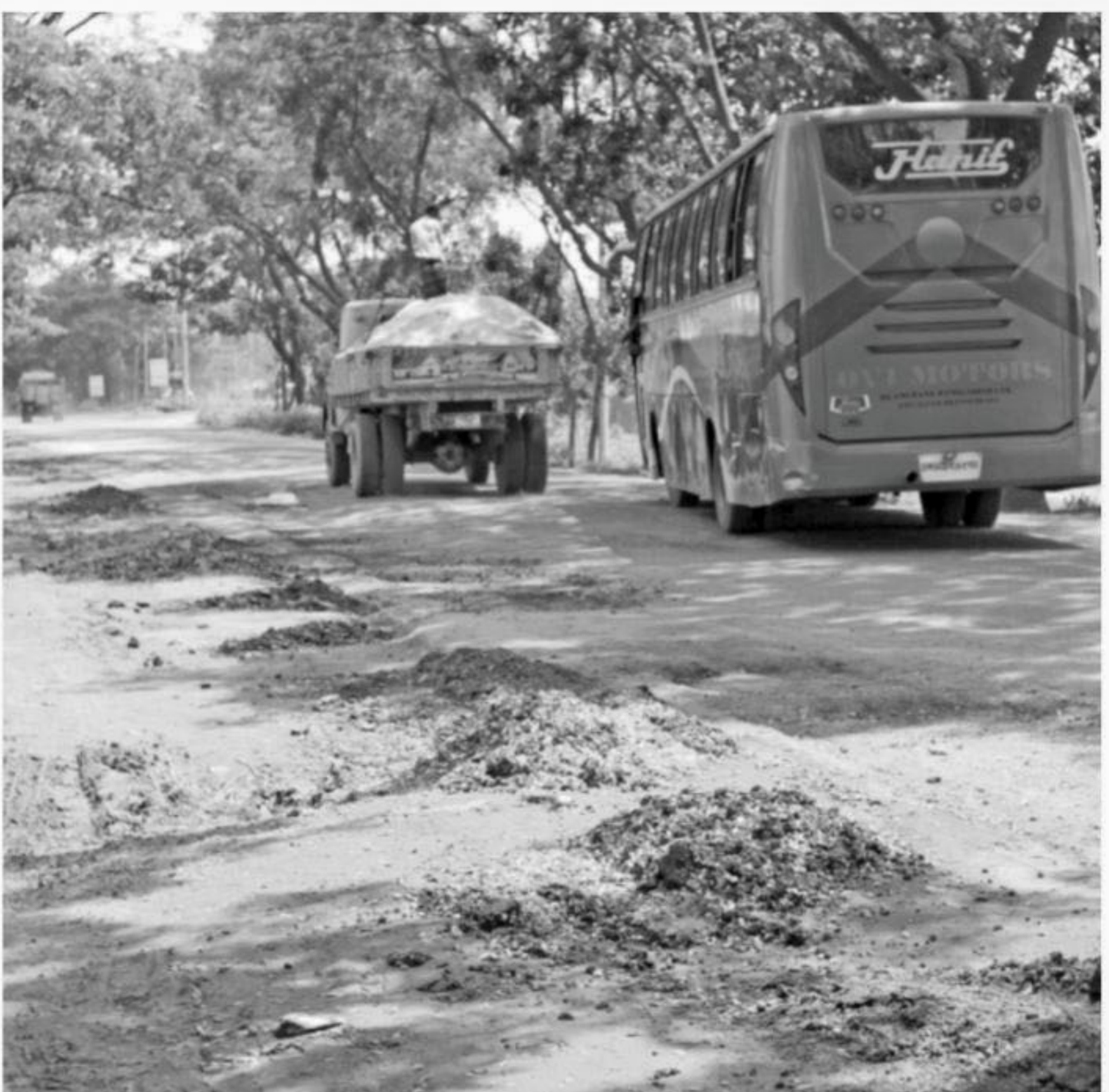
This photo taken from Rasulpur on Dhaka-Tangail highway in Tangail Sadar upazila yesterday could be a representative one on the important road, as frequent repair work during the ongoing monsoon proves too futile to bring a lasting solution. Drivers of vehicles have alleged that the authorities concerned conduct poor repair work to earn quick bucks by repeated tendering for the purpose.