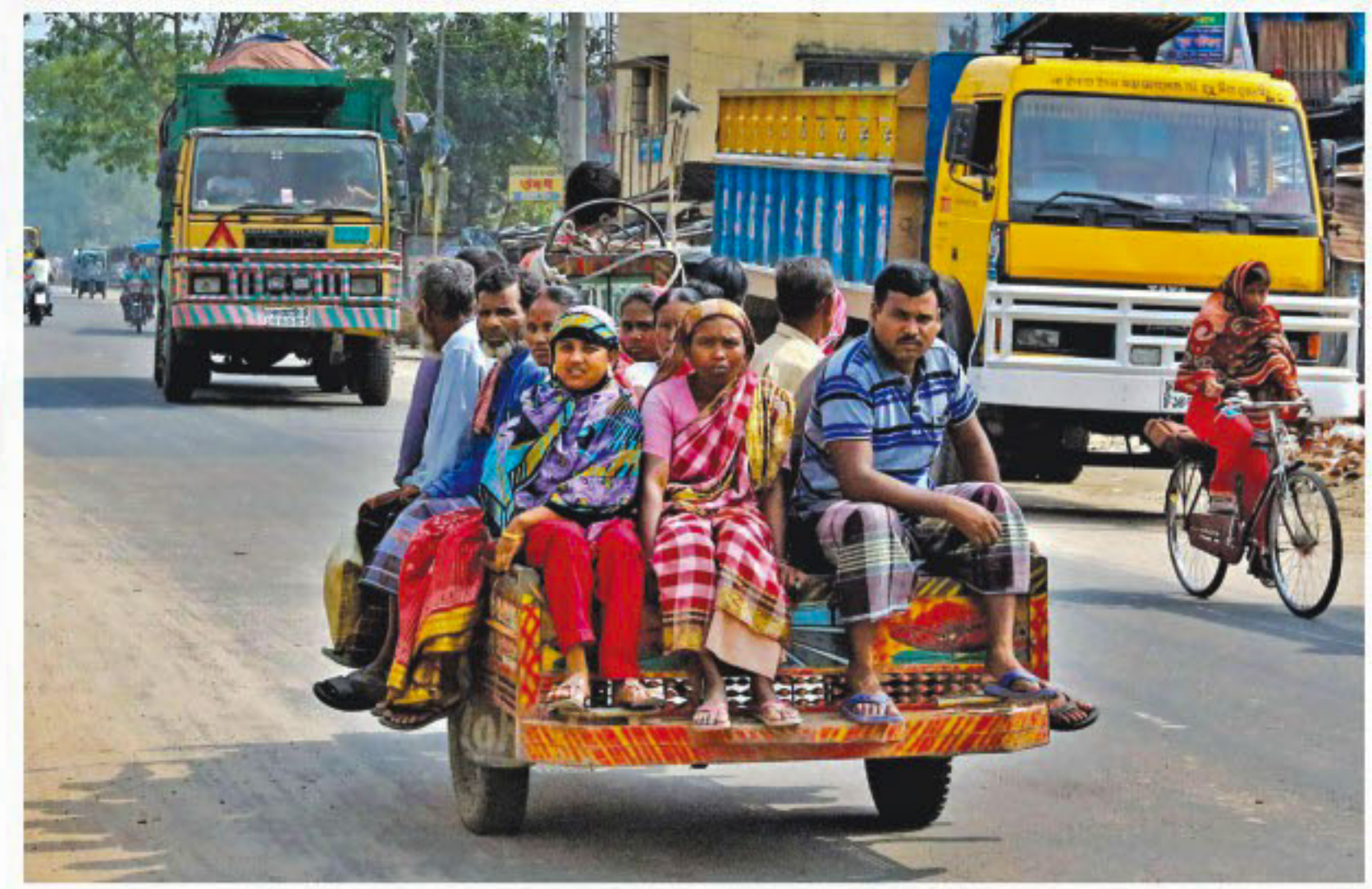
A man sits precariously on the foothold of a vehicle, locally known as Nosimon, while another stands beside the driver. People travel on the roof of a similar vehicle, top right , failing to find room inside. Passengers are crammed into another Nosimon, bottom right . These vehicles, built on water-pump engines, are not permitted on the highways, as they are unfit and prone to serious accidents. In reality, these three-wheelers are a commonplace. Not only do people routinely get on them, they do it dangerously, risking their lives. The photos were taken on the Dhaka-Dinajpur highway at Baneshwar in Dinajpur a few days ago.