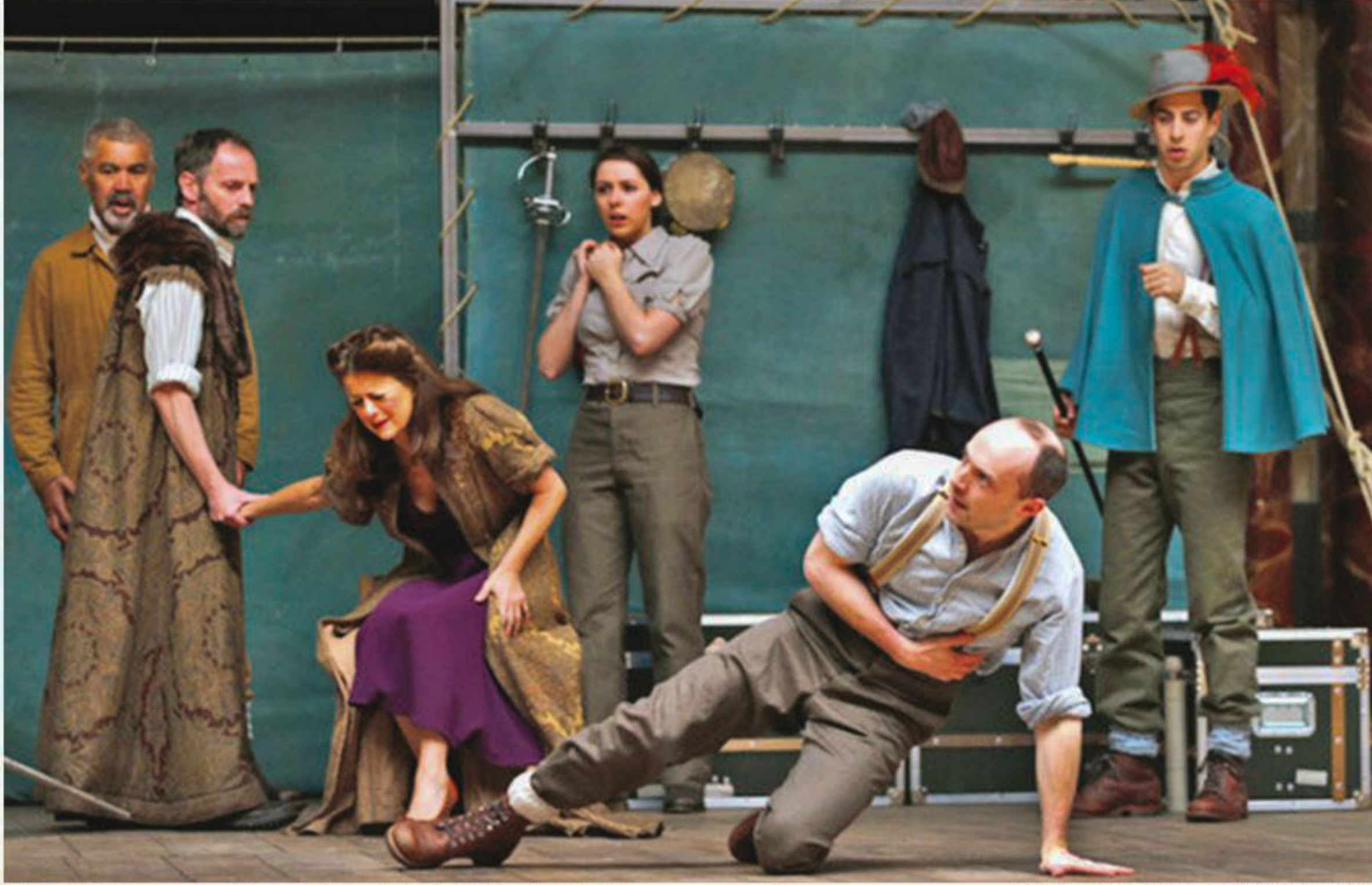
The British production of 'Hamlet' will be in Dhaka next month.

The play will be staged at the National Theatre Hall of BSA on July 15 at 7:30pm.