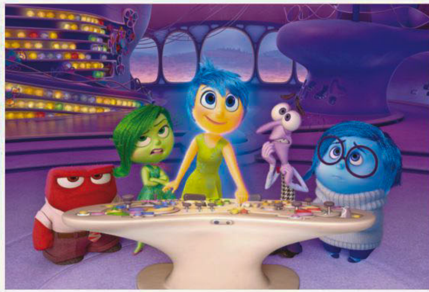
Animated feature "Inside Out" has received rave reviews.

"Jurassic World" now ranks as the fifth highest-grossing domestic release of all time with $500 million in Stateside receipts, behind "The Dark Knight" ($534.8 million). It marks the third consecutive weekend that the dinosaur thriller has topped North American