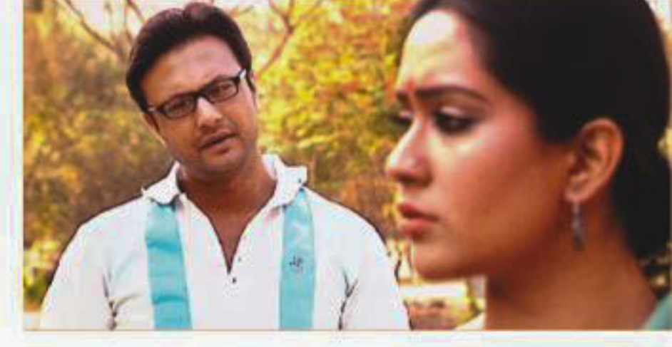
situations in her married life and decides to divorce her husband Rana.

The serial encircles protagonist Kamini who gets in trouble after marrying a psychopath. Kamini goes through terrible