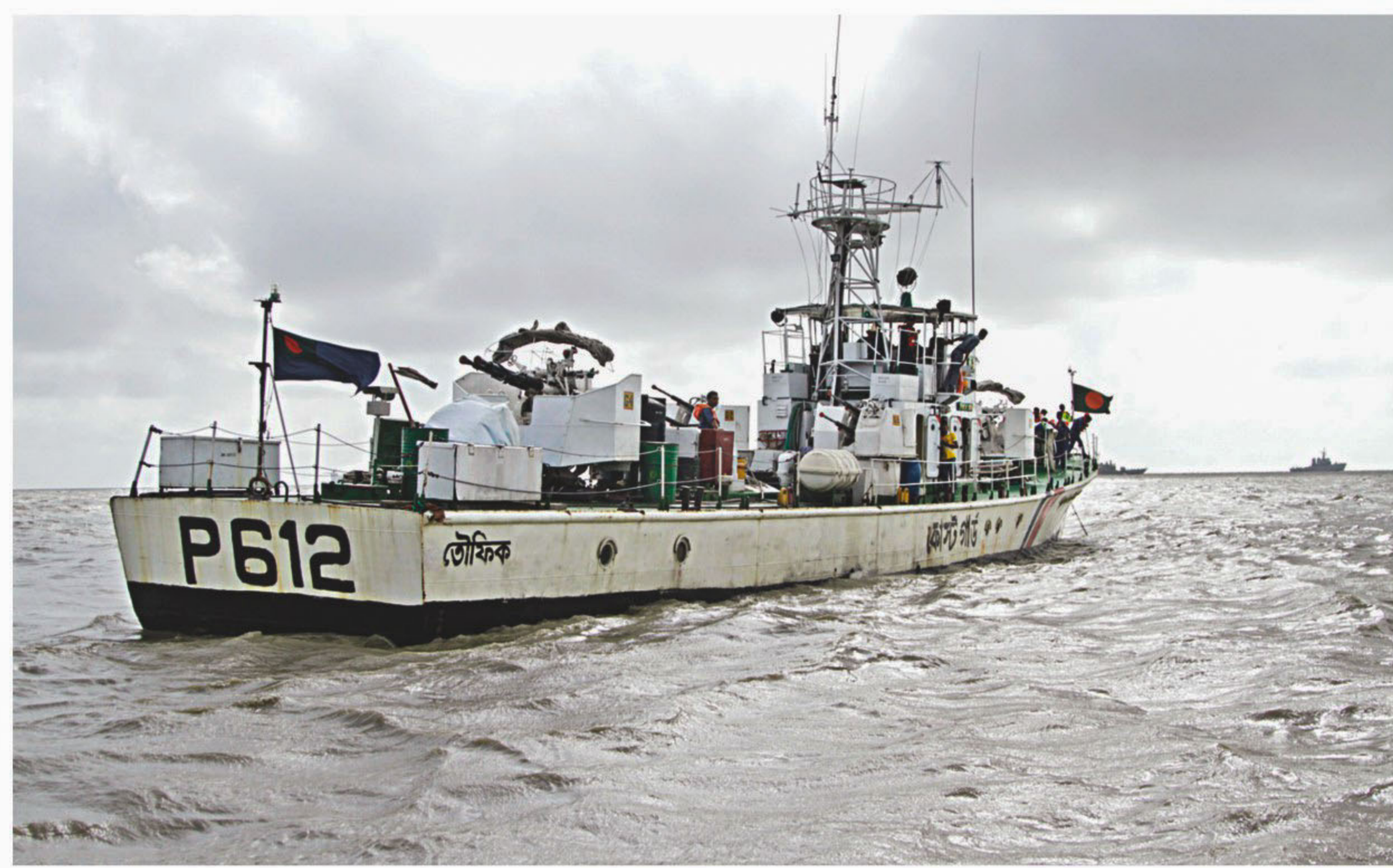
A naval ship searching for the missing pilot of the F-7 fighter that went down into the Bay of Bengal yesterday morning.

The Special Judge's Court-3 of Dhaka on June 18 scheduled next hearing of the two cases against the BNP chief for July 23.