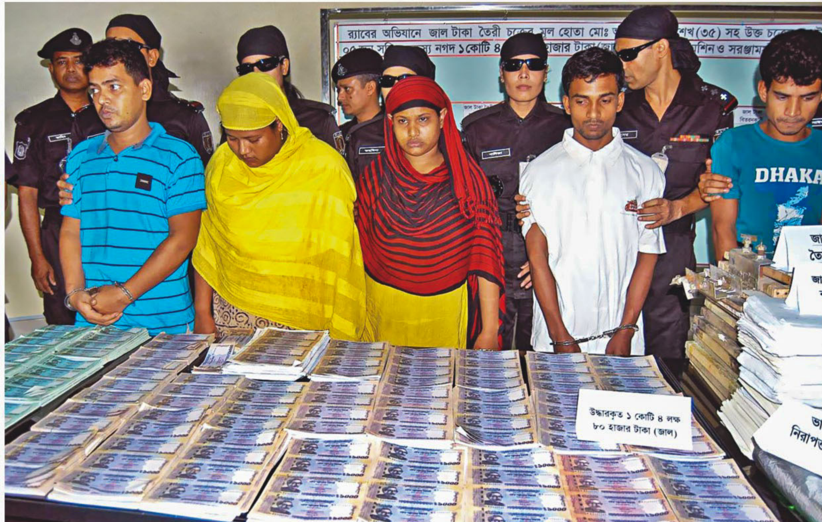
Arrested members of a counterfeit money racket are paraded before the press at the Rab headquarters in the capital's Uttara yesterday. The elite force also seized fake notes along with equipment for printing fake money.

He also criticised the government for building a car park at the centuries-old Lalbagh Fort by demolishing a part of its wall.