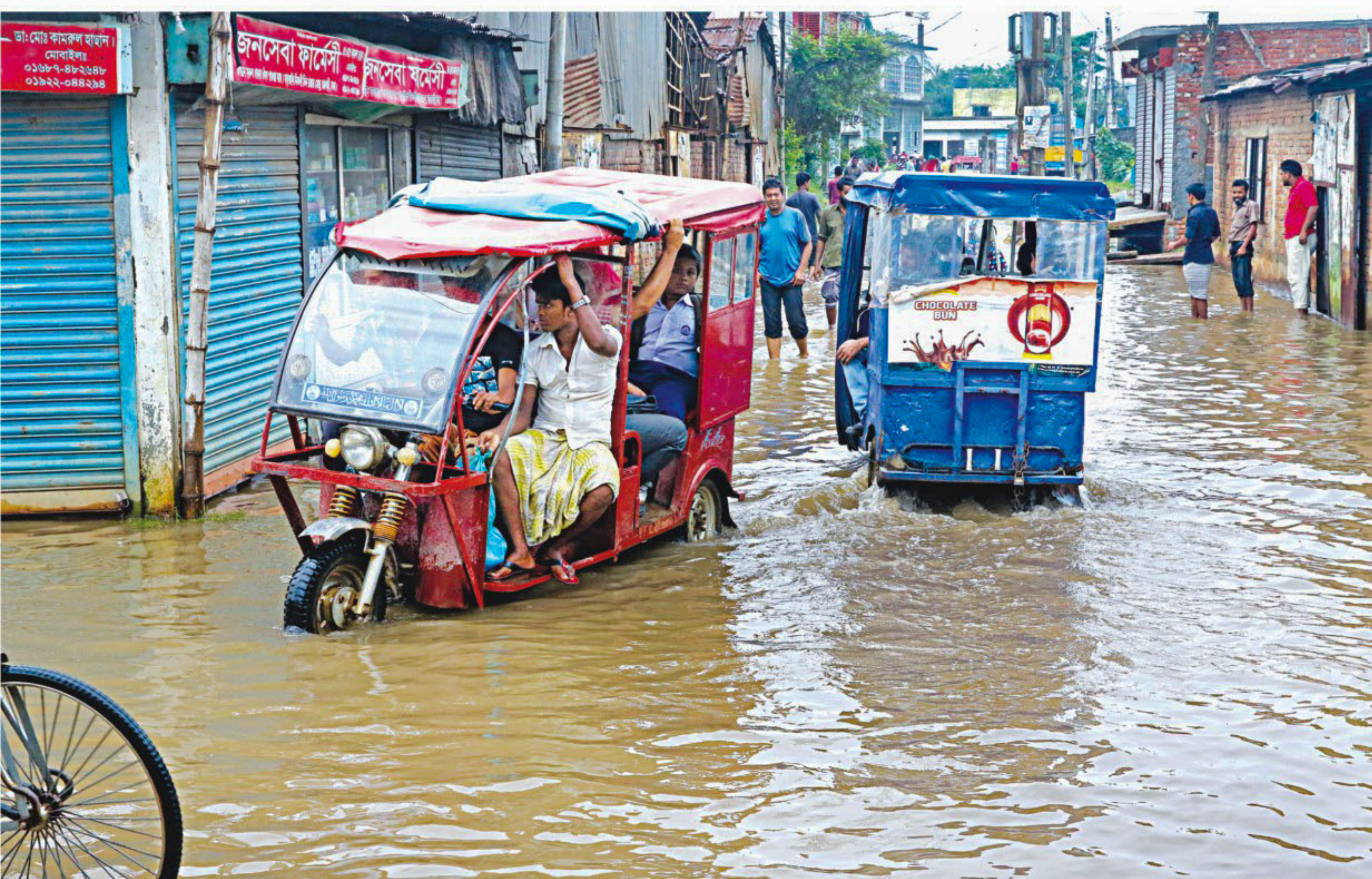
Auto-rickshaws going through a pool of knee-deep water on a road in Matuail of Dhaka yesterday. Like this part of the capital, many other areas have become waterlogged due to monsoon rain of the last few days.

Khaleda also alleged that the "police have gone out of the government's control". "The arms of police are longer than that of the law."