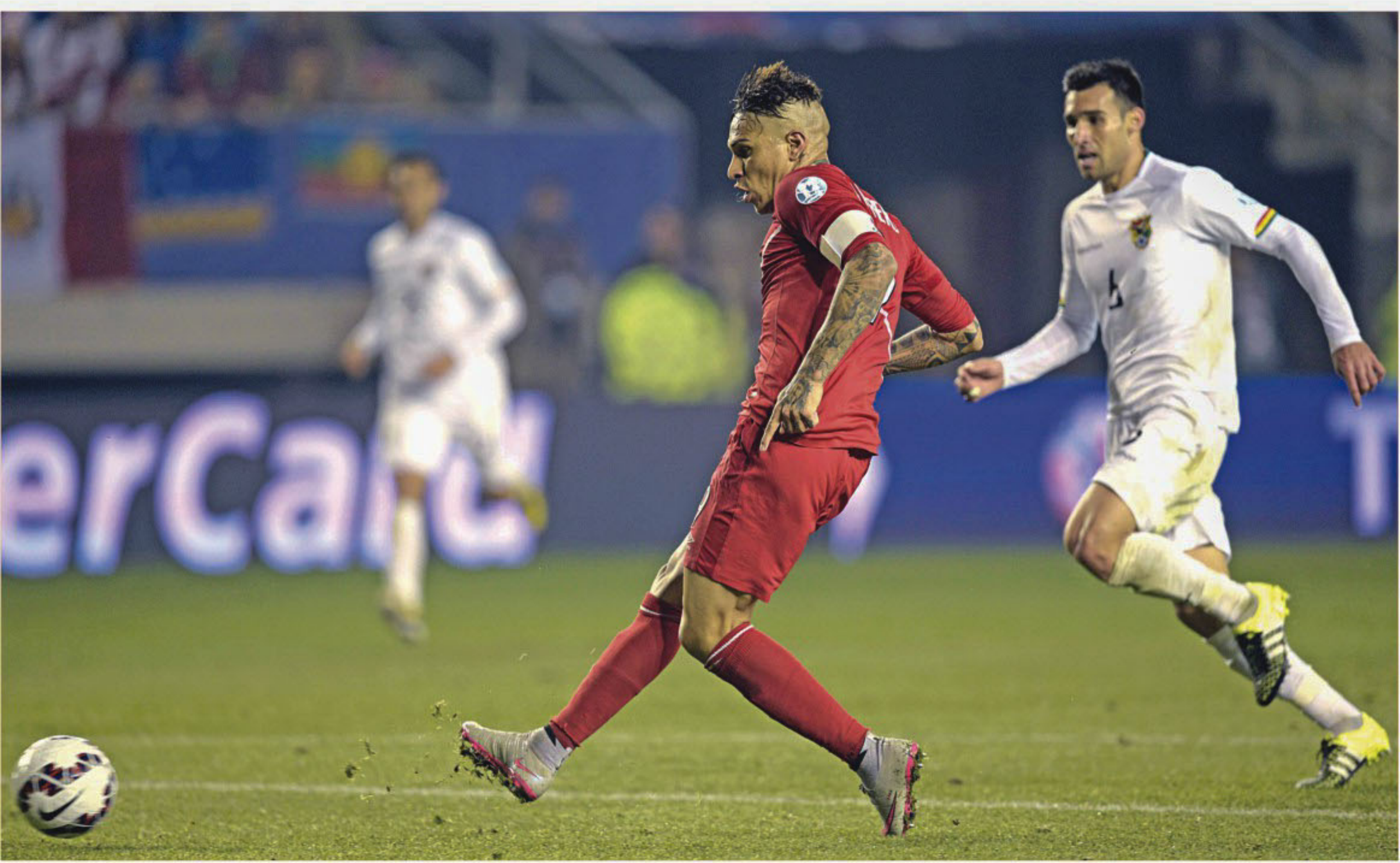
Peru forward Paolo Guerrero (L) scores his third goal against Bolivia during their Copa America quarterfinal in Temuco on Thursday.