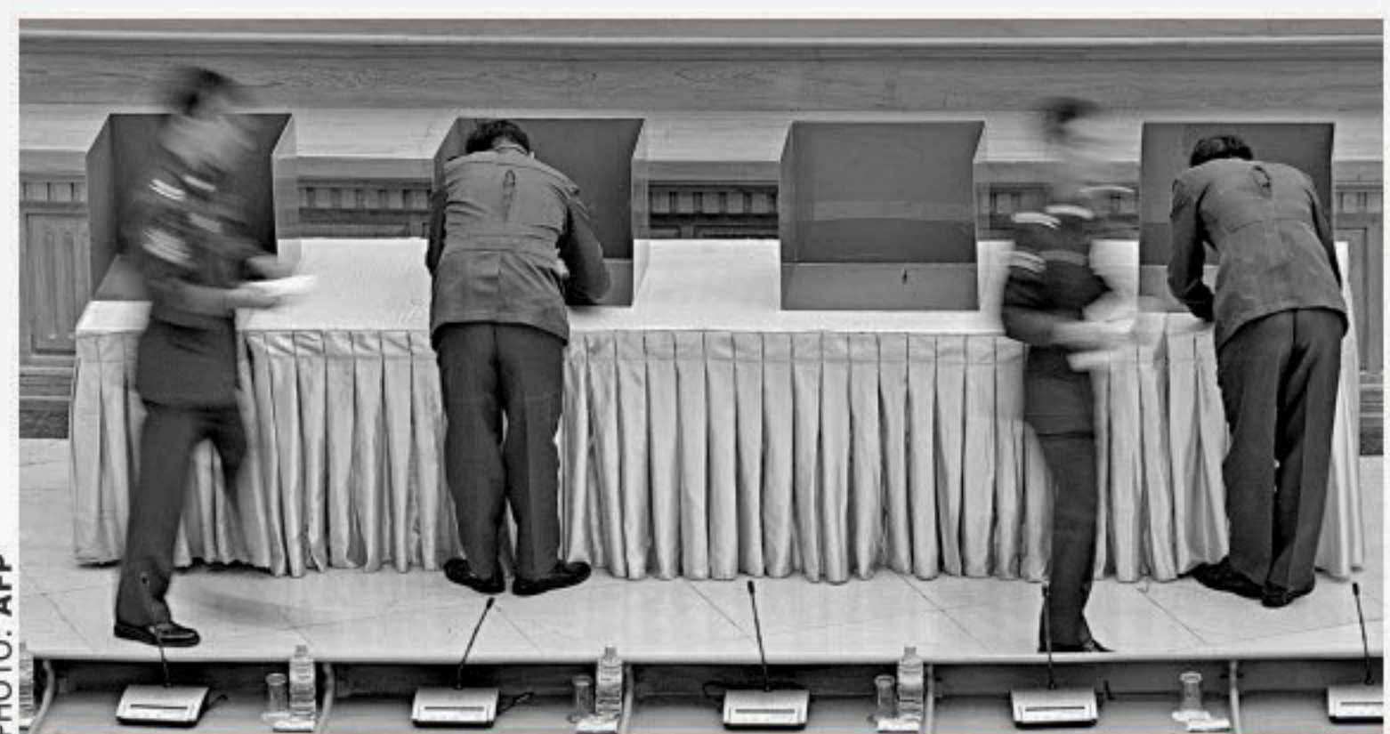
Military members of parliament cast their votes on a draft amendment to the constitution at a session of parliament in Naypyidaw, yesterday.

But with Suu Kyi barred from the top job and no obvious second candidate within the NLD, observers predict the party could end up supporting a presidential candidate