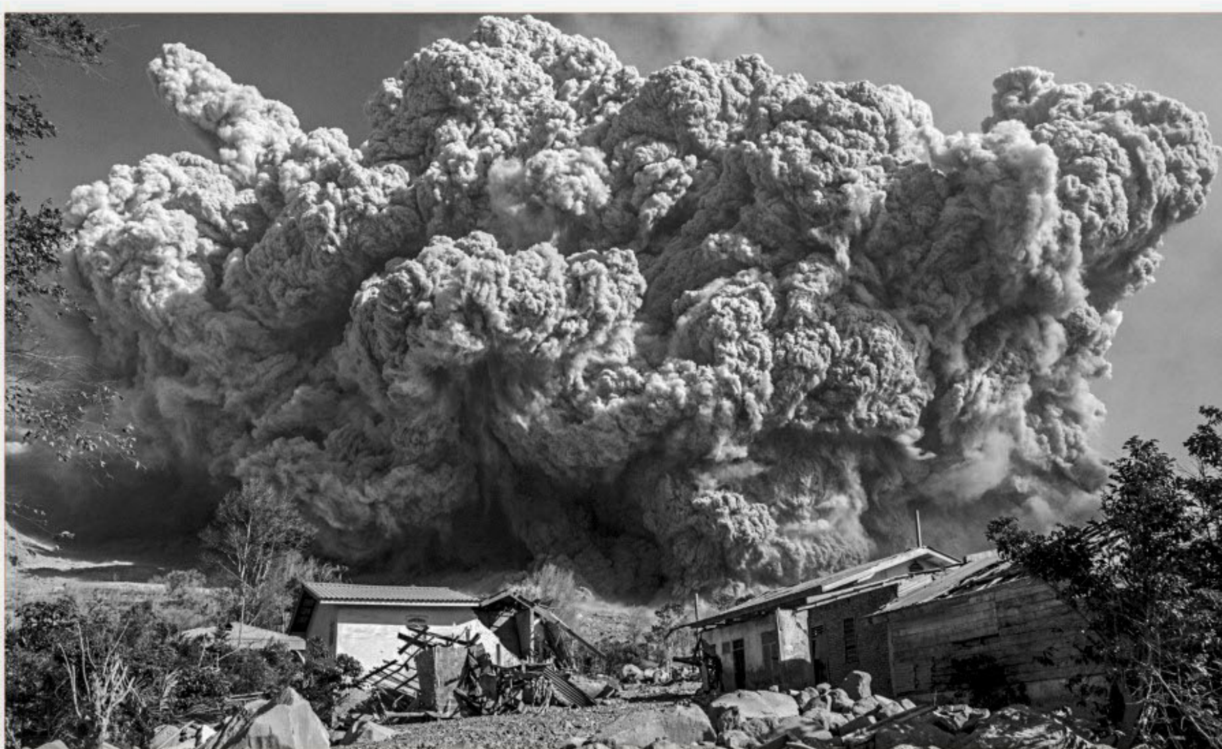
Mount Sinabung volcano spews giant volcanic ash in Karo, North Sumatra, yesterday. Sinabung is one of 129 active volcanoes in Indonesia, which sits on the Pacific Ring of Fire, a belt of seismic activity running around the basin of the Pacific Ocean.

Journalists are facing "unprecedented threats" in Egypt with a record number behind bars, mostly for links with now banned Muslim Brotherhood, a media watchdog said yesterday. The Committee to Protect Journalists said at least 18 journalists, many of whom worked for online media, were locked up in Egypt, the most since it began keeping records in