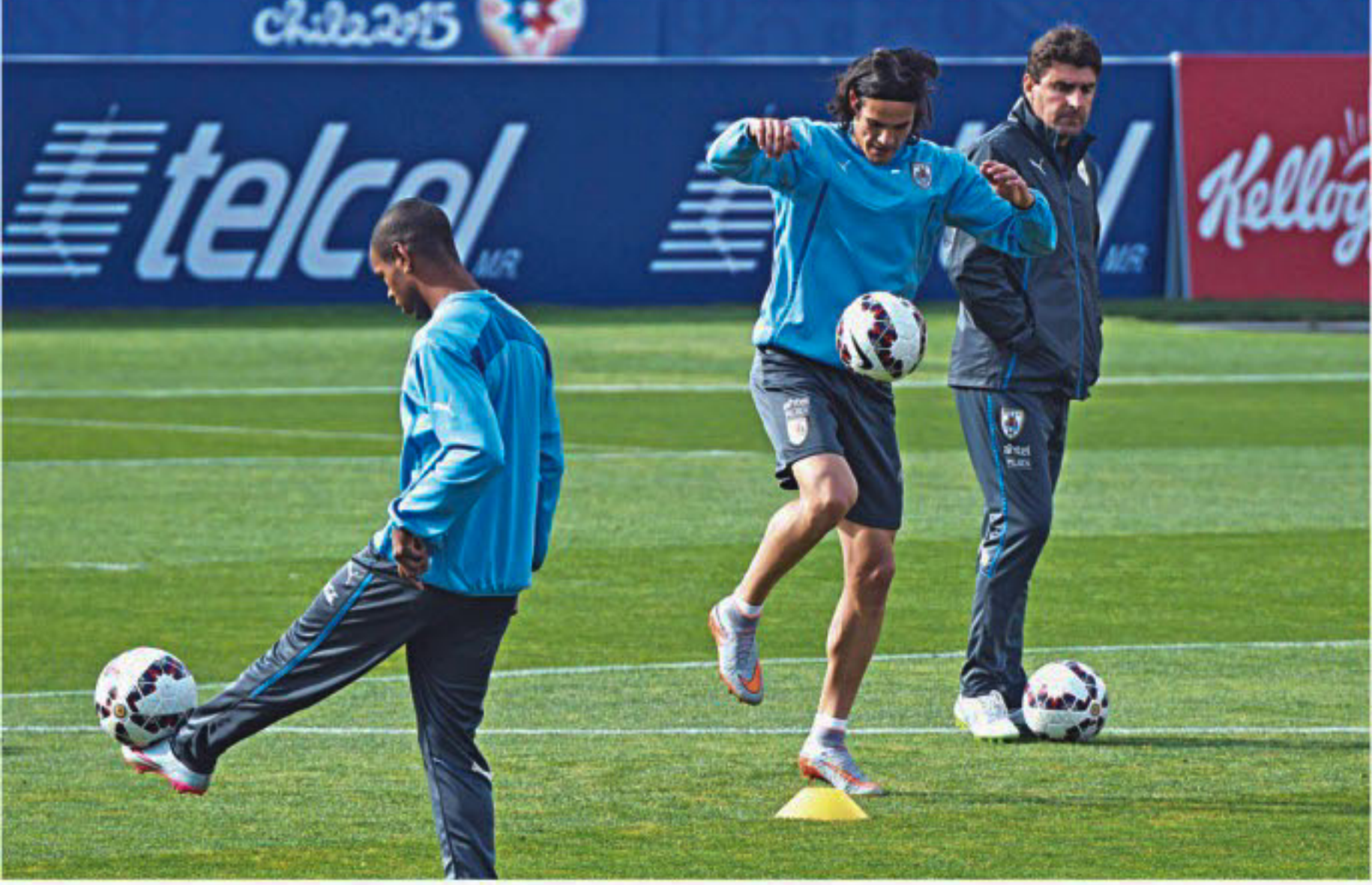
Uruguay striker Edinson Cavani (C) controls the ball during a training session at the Nacional Stadium in Santiago on Tuesday.