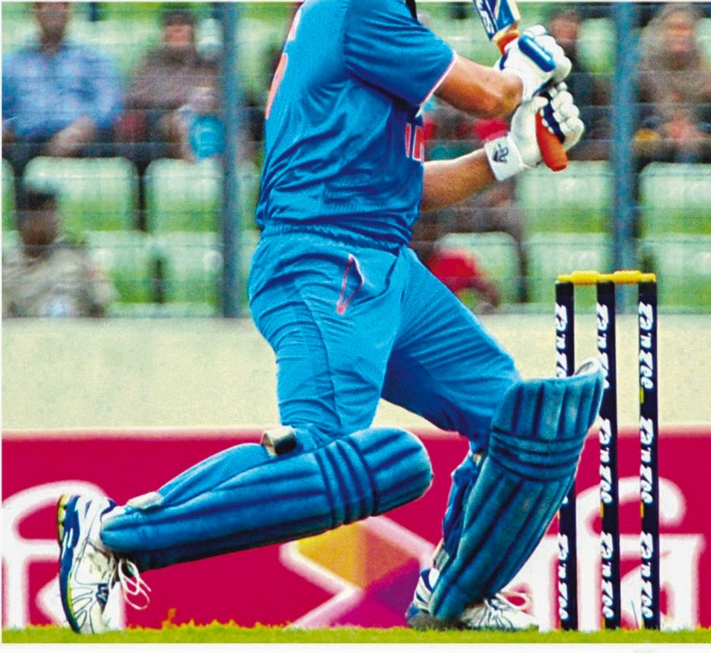
India skipper Mahendra Singh Dhoni scored 69 runs in an impressive performance against Bangladesh in the third and final ODI at Mirpur yesterday.