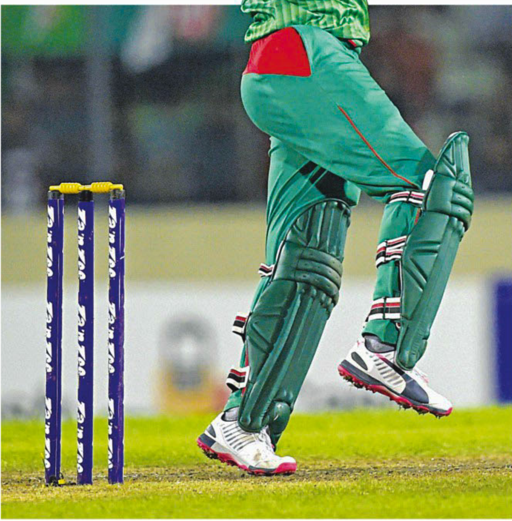
Shakib Al Hasan scored a steady 51 not out, picking up five boundaries, and his stability proved vital to the victory over India in the second ODI in Mirpur yesterday.