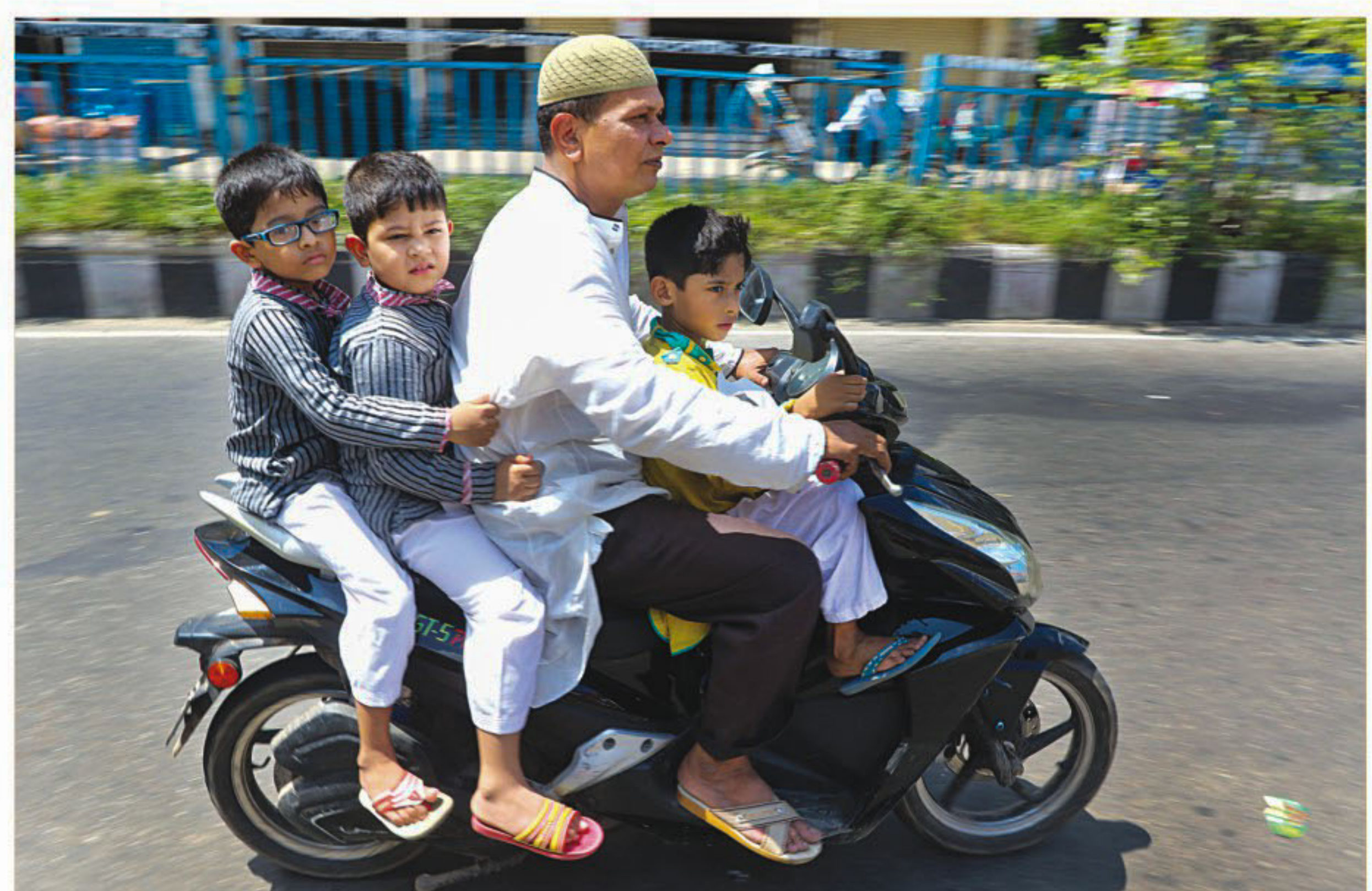
A man driving a scooter with three minor pillion riders in a city street. He appears least bothered about the consequences in case there was an accident, especially as neither he nor the kids were wearing any helmets.