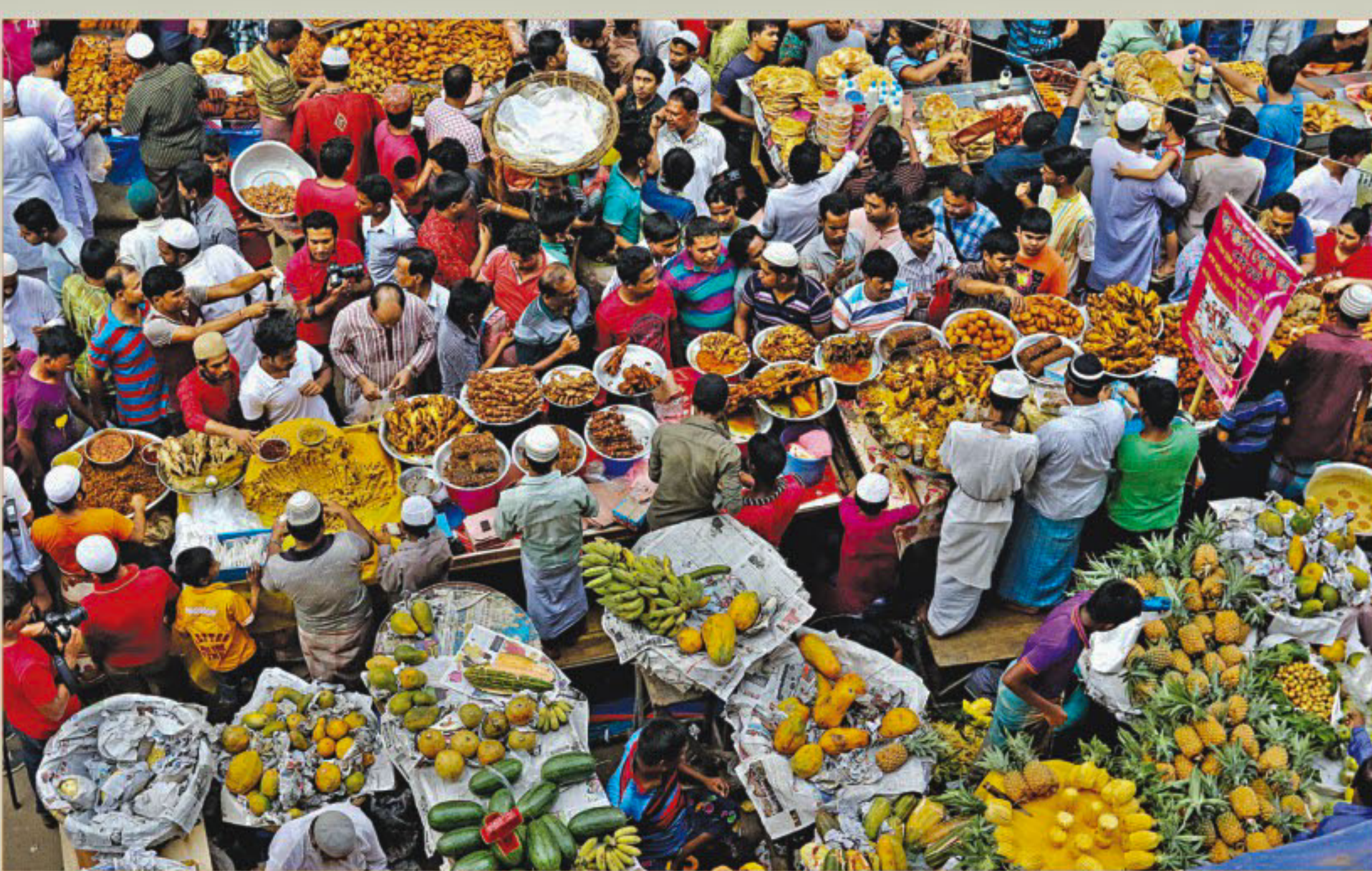
Iftar delicacies being sold at Chawkbazar in Old Dhaka yesterday. This is the biggest market in the capital where iftar items are sold throughout the month of Ramadan.