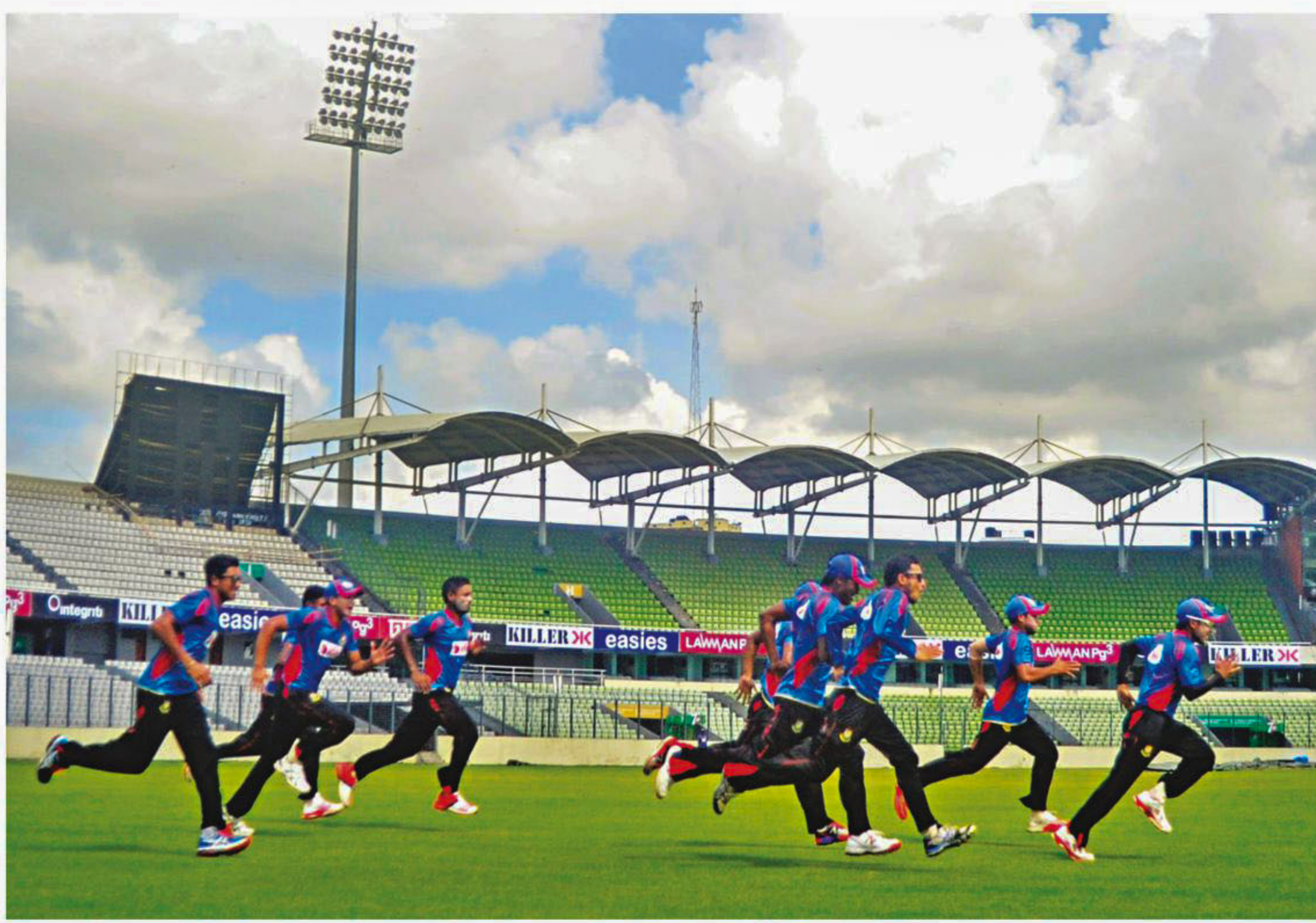
With clouds hovering above, the Tigers train at Bangladesh's home of cricket in Mirpur yesterday, ahead of their opening one-day international against India today. Weather permitting, the match will start at 3:00pm.