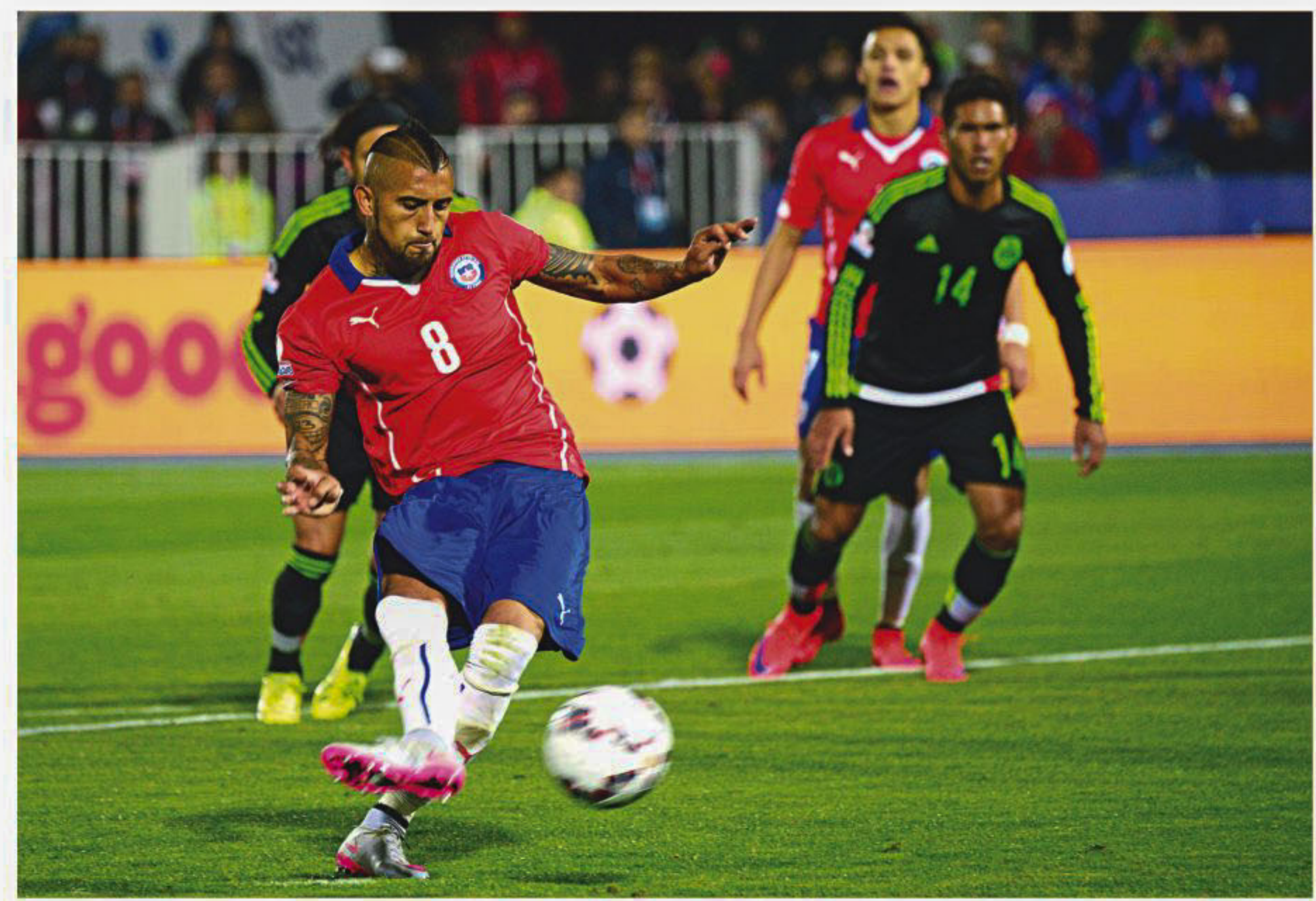
Chile midfielder Arturo Vidal scores his second goal from a penalty during their Copa America encounter against Mexico in Santiago on Monday.

A group of Russian football lovers has started a fundraising campaign aimed at collecting the sum of 21.4m euros ($24.2 million) needed to buy the national squad manager Fabio Capello out of his contract. Capello has again come in for heavy criticism following Sunday's 1-0 home defeat in Euro 2016 qualifying campaign to Austria.