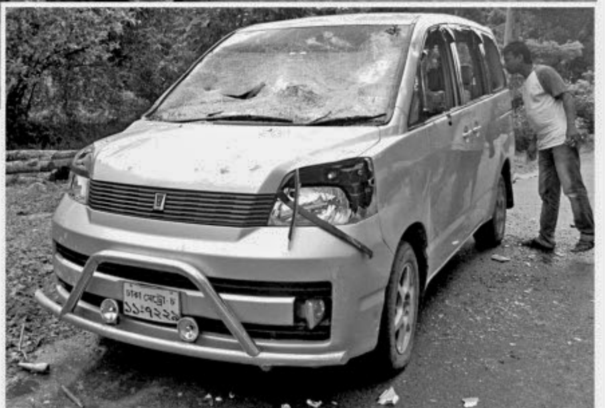
Stick holding villagers including a good number of women get ready to prevent some people's attempt to occupy a piece of land at Radhanagar village in Srimangal upazila under Moulvibazar district yesterday. Inset, the car of Syed Liakat Ali, brother of Social Welfare Minister Syed Mohsin Ali, got damaged during a clash between the villagers and the alleged land grabbers.