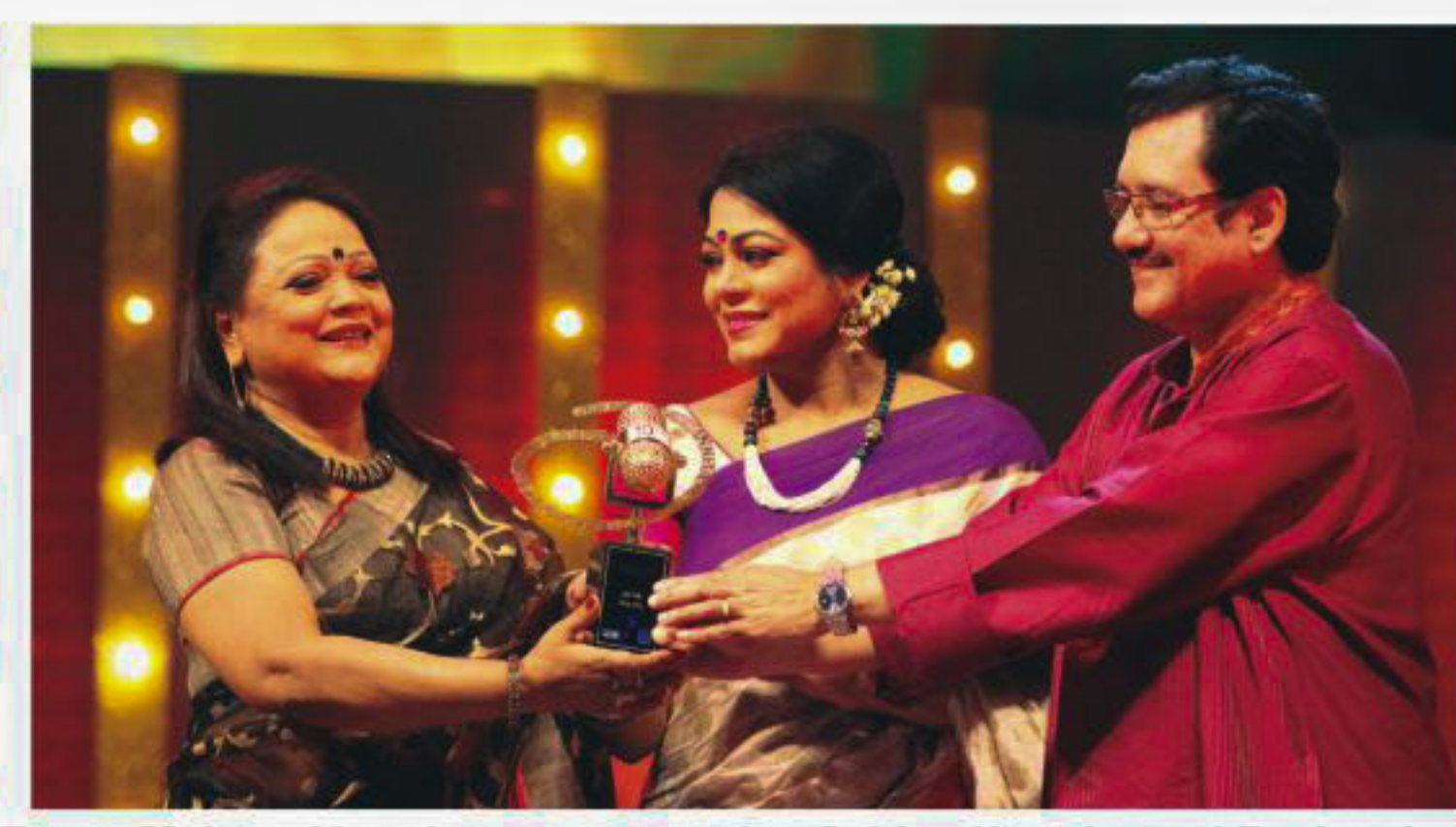
(Clockwise from top): Dancers perform at the event; Ferdous Ara and Tapan Mahmud hand over an award to Sabina Yasmin, and Ferdousi Rahman receives award at the ceremony.

STAFF CORRESPONDENT Citycell-Channel i Music Award, the largest award giving ceremony in the country's music scene, was held in Mirpur Indoor Stadium in the capital on June 15 evening. Hundreds of artistes attended the ceremony, which has been taking place for the last 10 years.