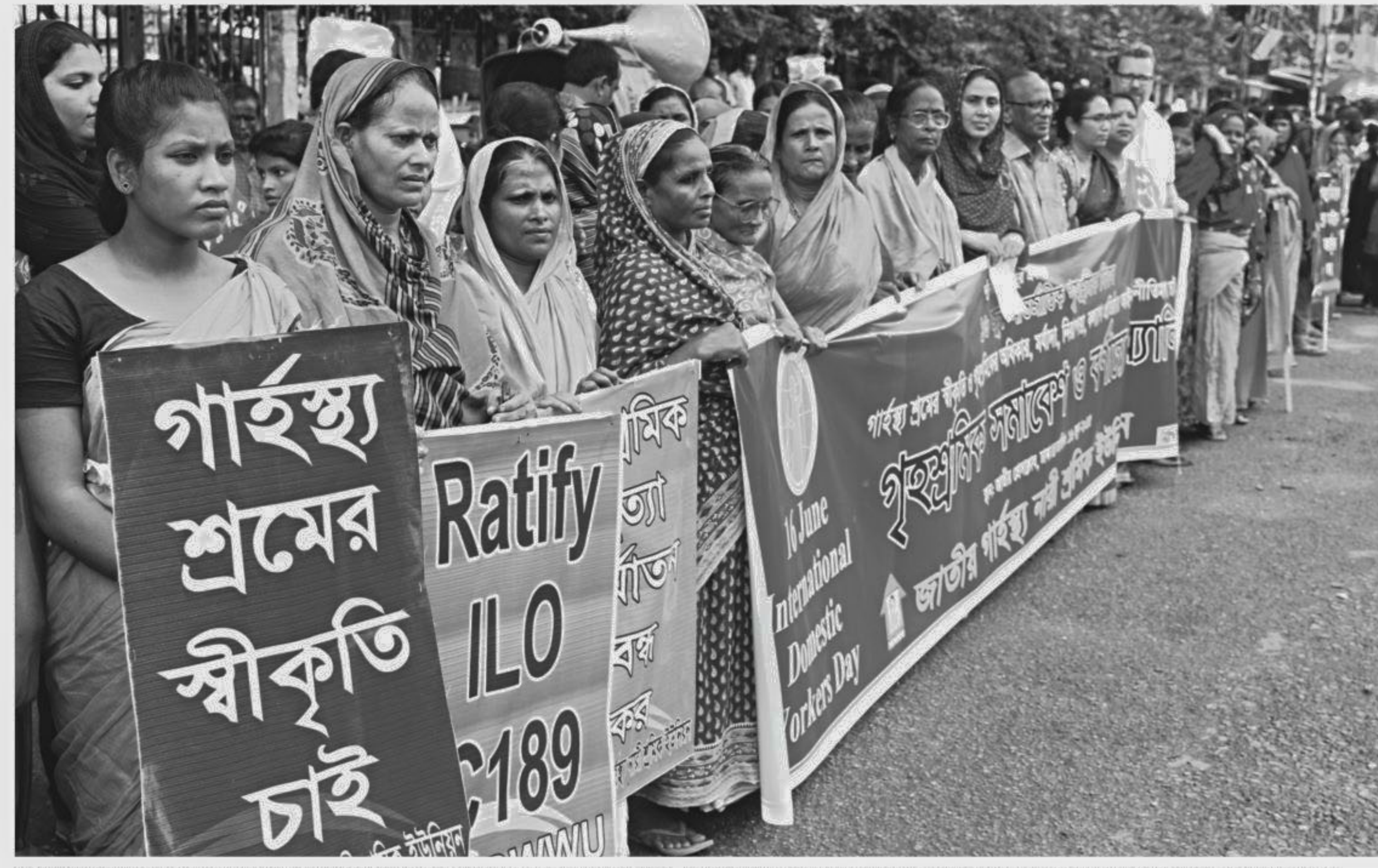
Jatiya Garhastha Nari Sramik Union forms a human chain in front of Jatiya Press Club in the capital yesterday demanding recognition of domestic work.