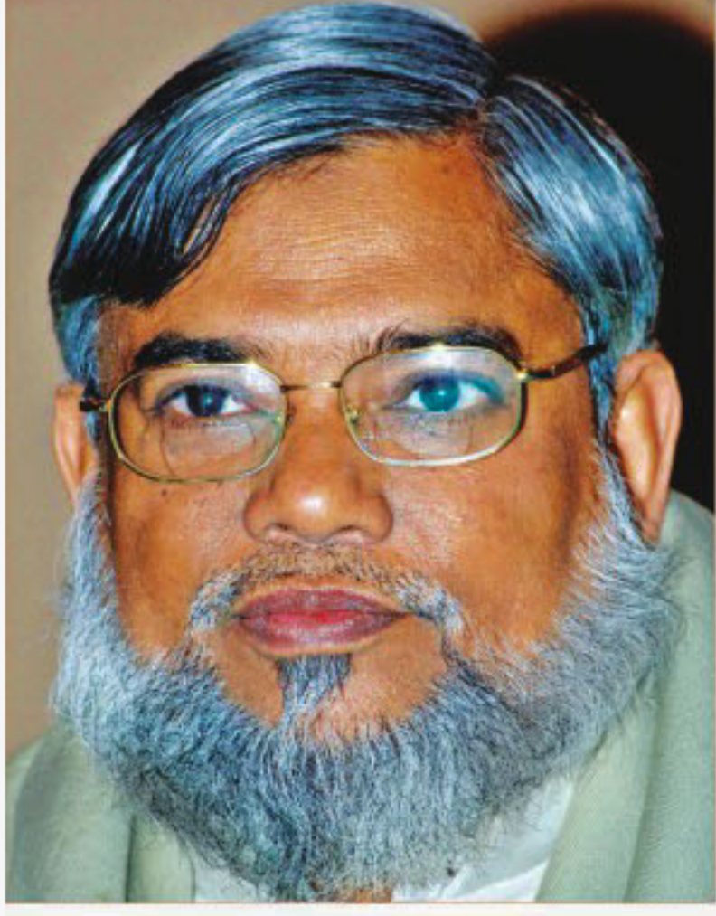
SEE PAGE 2 COL 1

The Supreme Court yesterday unanimously upheld the death penalty of Ali Ahsan Mohammad Mojaheed for planning and instigating the killing of intellectuals and professionals at the fag end of the country's Liberation War. The SC verdict has paved the way for execution of the Jamaat-e-Islami secretary general and also a former minister, originally sentenced to death by a war crimes tribunal two years ago. During the nine-month bloody war, he was chief of the infamous Al-Badr Bahini, an auxiliary force of the Pakistan occupation army, responsible for abducting, torturing and killing freedom fighters, intellectuals and pro-liberation people. This is the first time an ex-minister's death sentence for war crimes has been