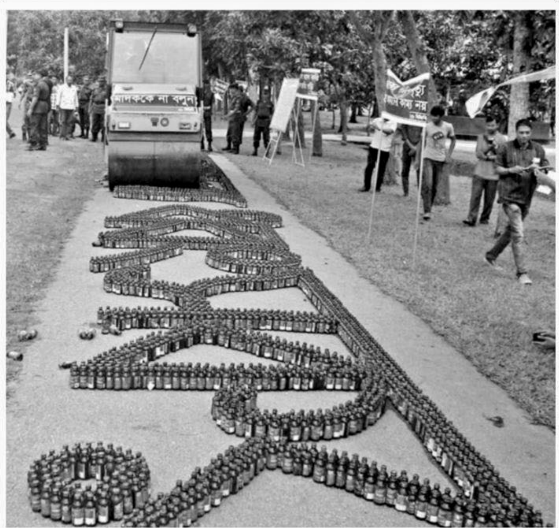
BGB destroys around 26,000 bottles of phensidyl at 29 Battalion headquarters at Phulbari in Dinajpur yesterday.