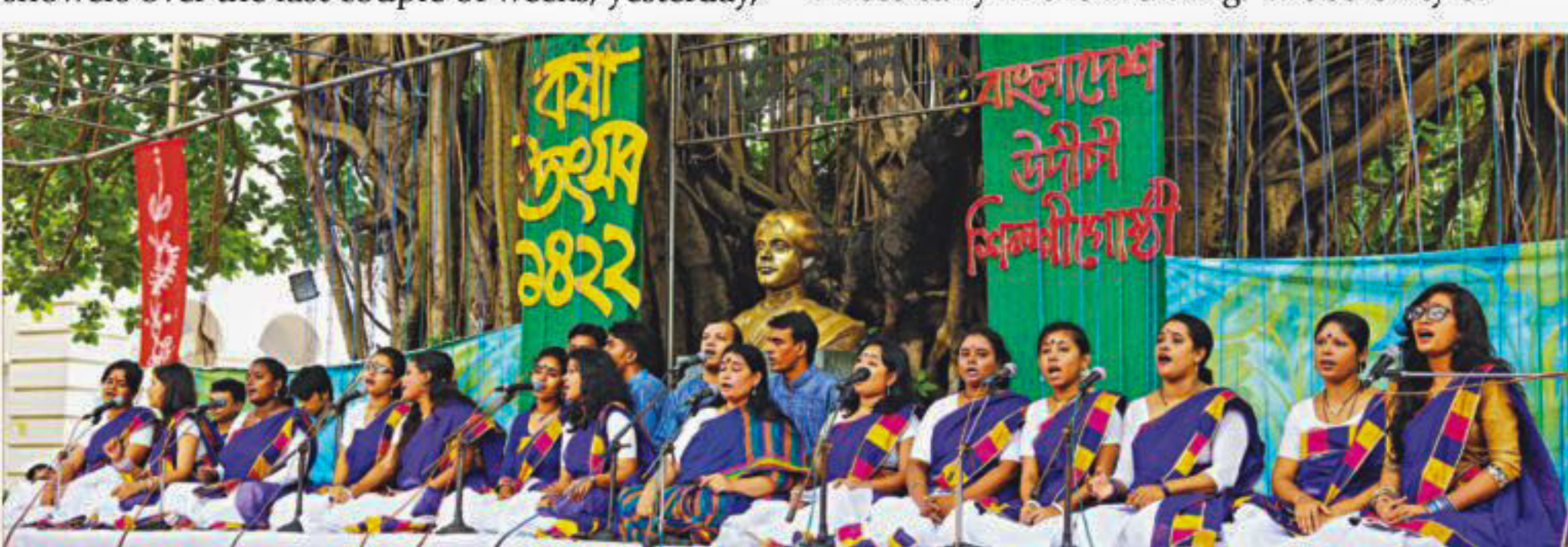
Artistes of Udiichi render a chorus at the event.

Solo and choral renditions, recitations and dances marked another programme at Bokultala, Charukala of Dhaka University. Satyen Sen Shilpi Goshti organised the programme.