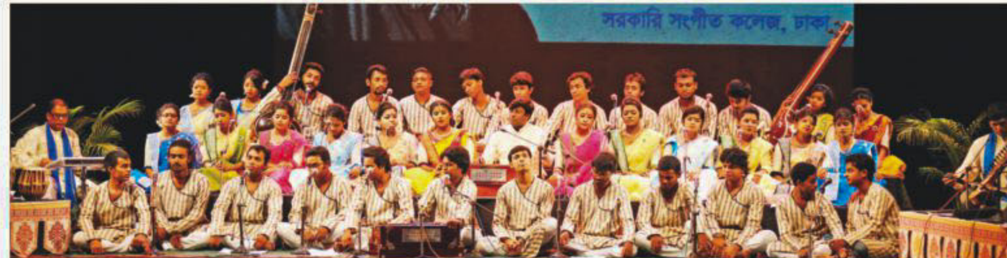
Singers of Govt. Music College perform a choral song.

As the artistes were taking the stage, "Anjali Loho Mor" was playing in the background. Then, the soiree began with "Bajao Amarey Bajao".