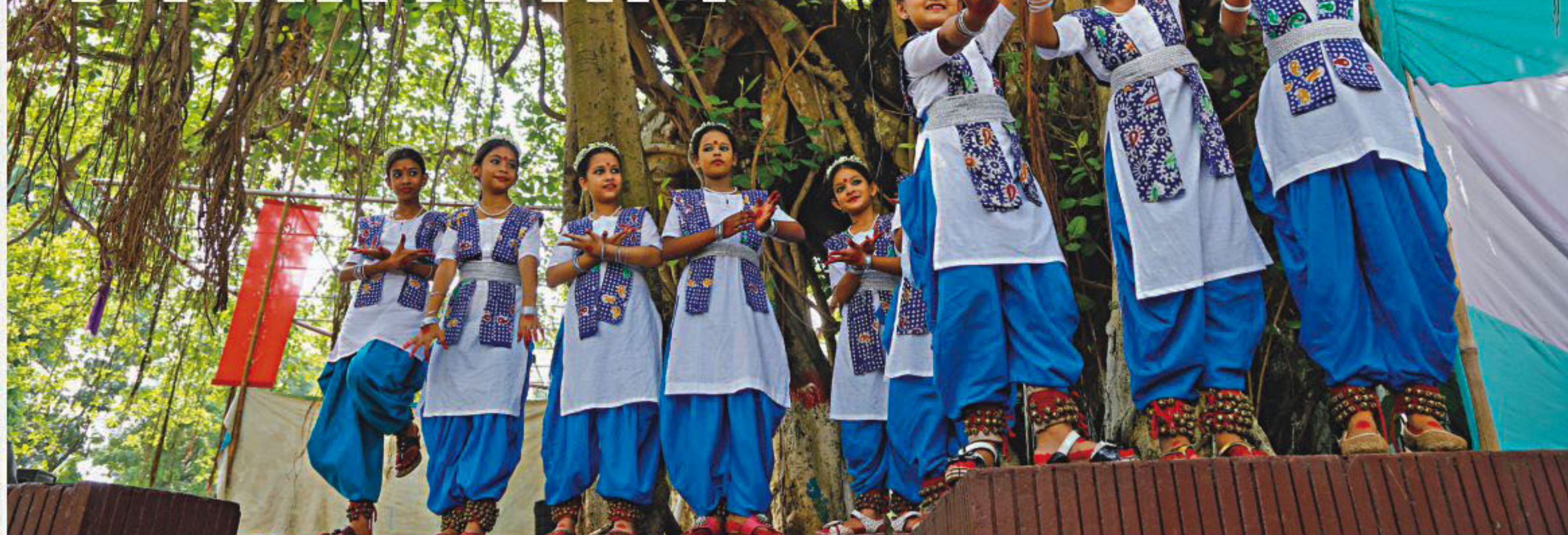
Nataraj artistes pose for a photograph after a riveting dance performance.