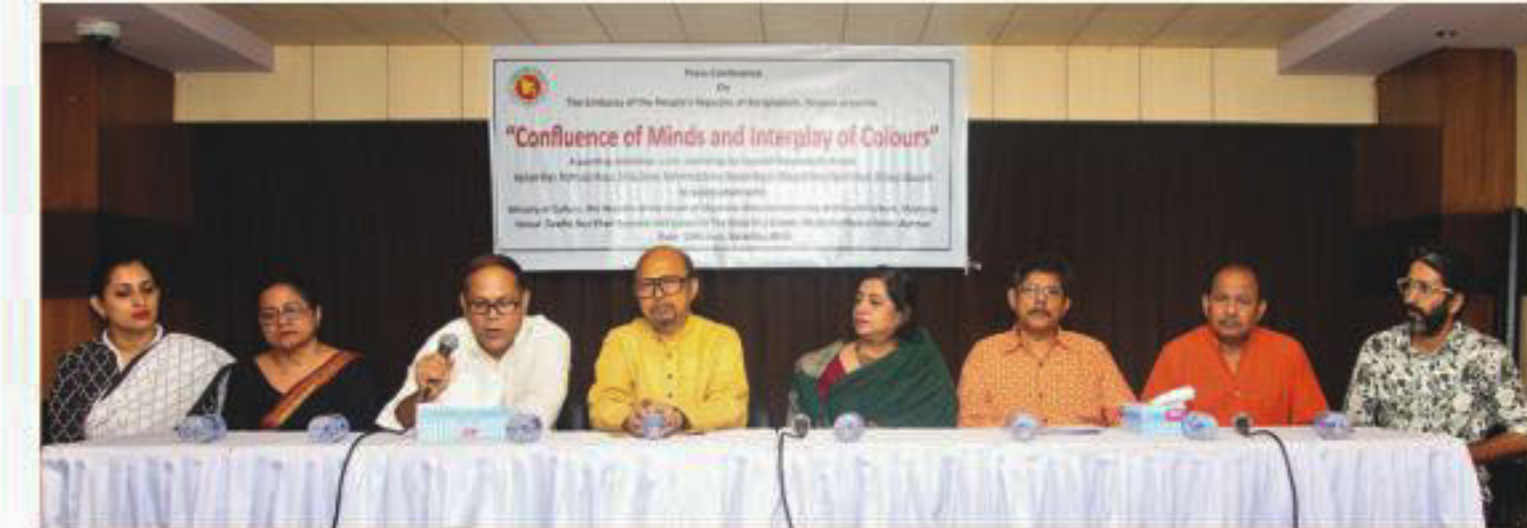
Artists with the organisers at the press meet.

The relationship between Bangladesh and Myanmar is deeply rooted in their shared history, culture and values spanning over many centuries. To further the camaraderie between the people of both countries, the Embassy has undertaken the initiative to offer Myanmar audience a glimpse of Bangladesh culture, through the first-ever exhibition of Bangladeshi paintings with the theme "Confluence of Minds and Interplay of Colours."