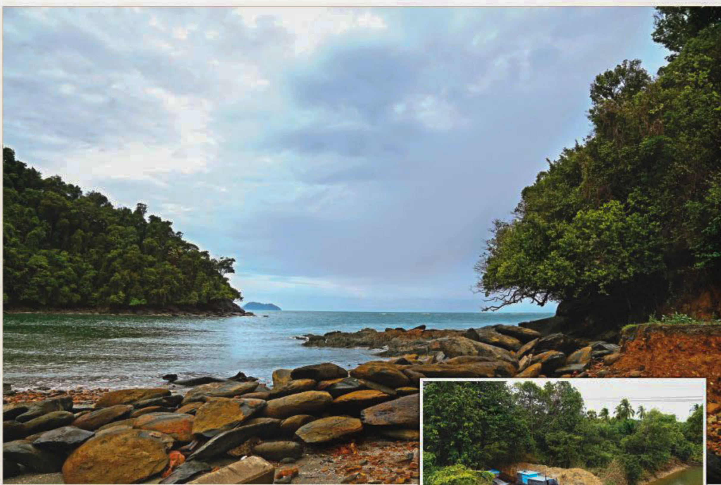
Bang Ben Bay in Thailand's Ranong province from where 295 Rohingyas and Bangladeshis were rescued in November last year. Inset, a trawler that carried the migrants to the Bay. The photos were taken on May 27.