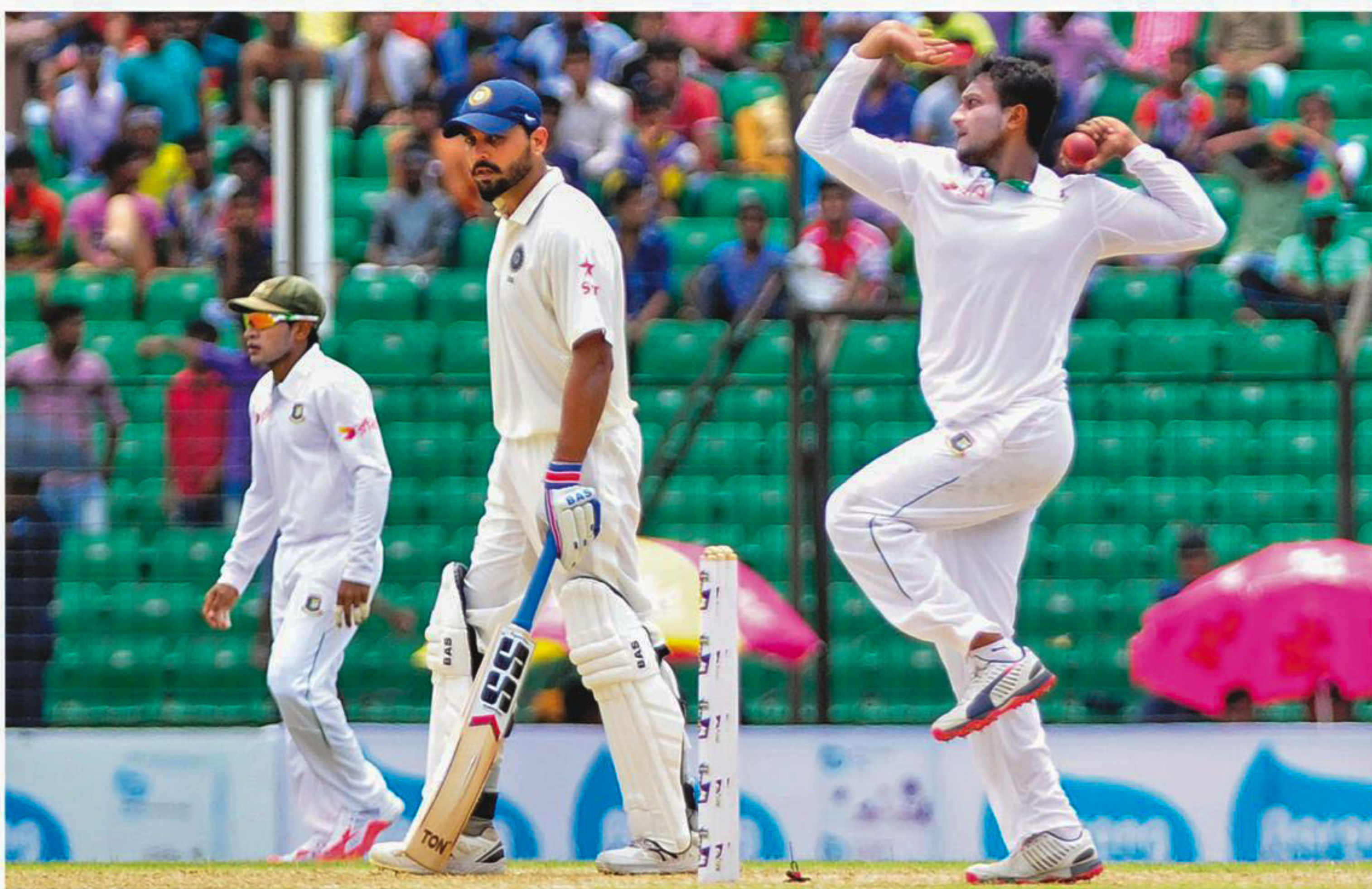
Shakib Al Hasan was relentless against India yesterday, taking four wickets and becoming the first Bangladeshi to take 100 Test wickets at home, as India reached 462 for six at the end of the third day of the one-off Test in Fatullah. Stories on page 14.