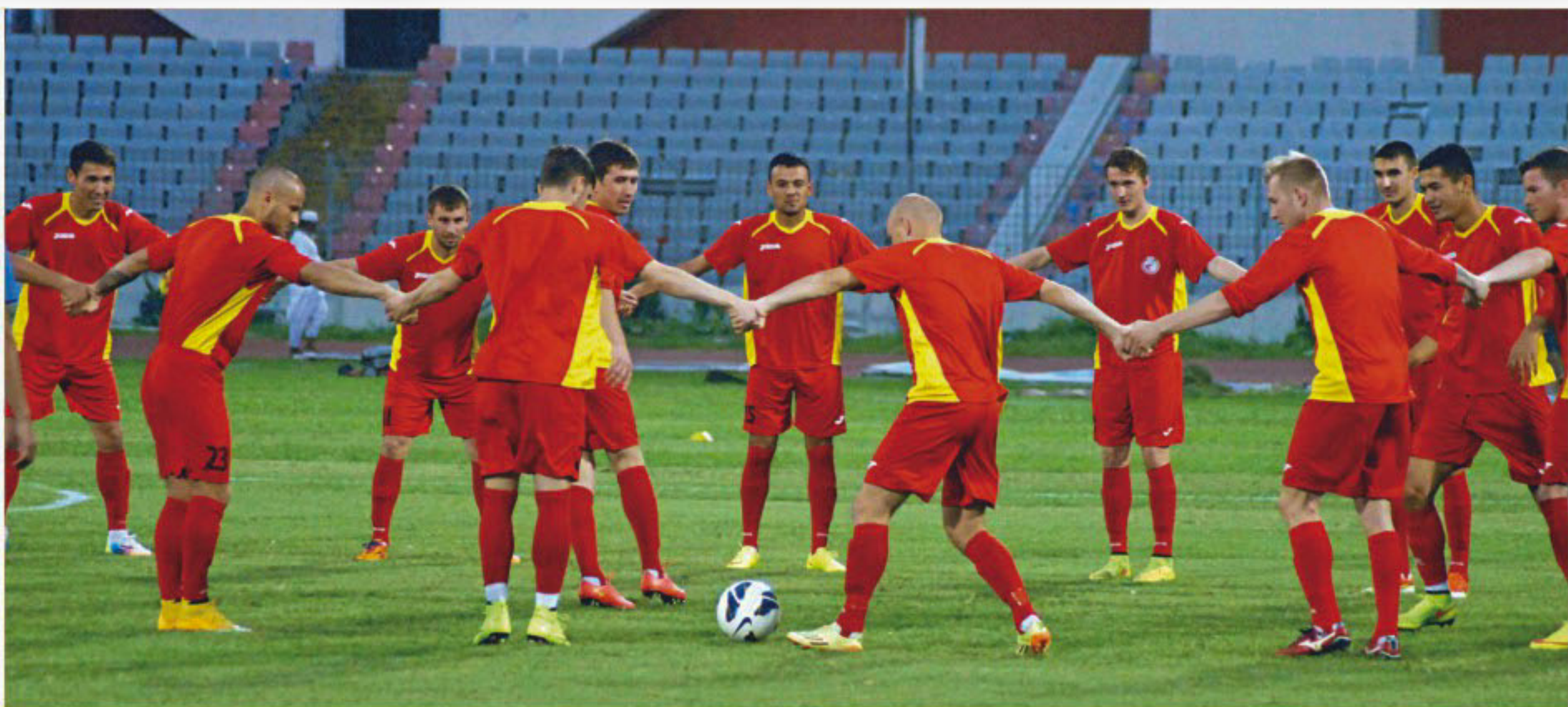
Bangladesh booters (L) sweated it out at the Sheikh Jamal Dhanmondi Club ground while their Kyrgyzstan counterparts warmed up at the Bangabandhu National Stadium yesterday, ahead of today's fixture of the Joint Qualifiers.