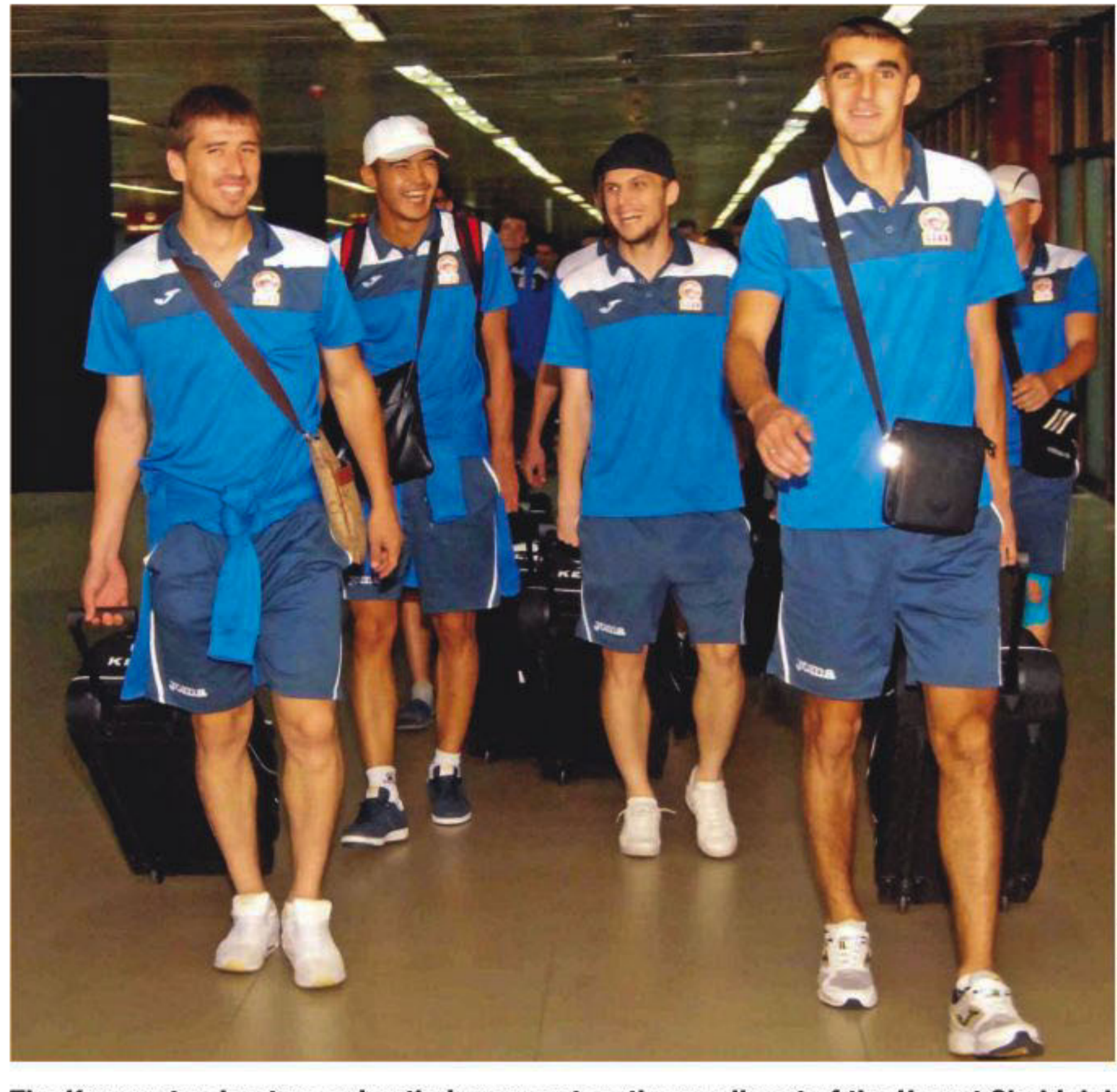
The Kyrgyzstan booters enjoy their moment as they walk out of the Hazrat Shahjalal International Airport after arriving here yesterday evening. The Central Asian nation will take on hosts Bangladesh in the first match of the Joint Qualifiers for the World Cup and the Asian Cup at the Bangabandhu National Stadium tomorrow.