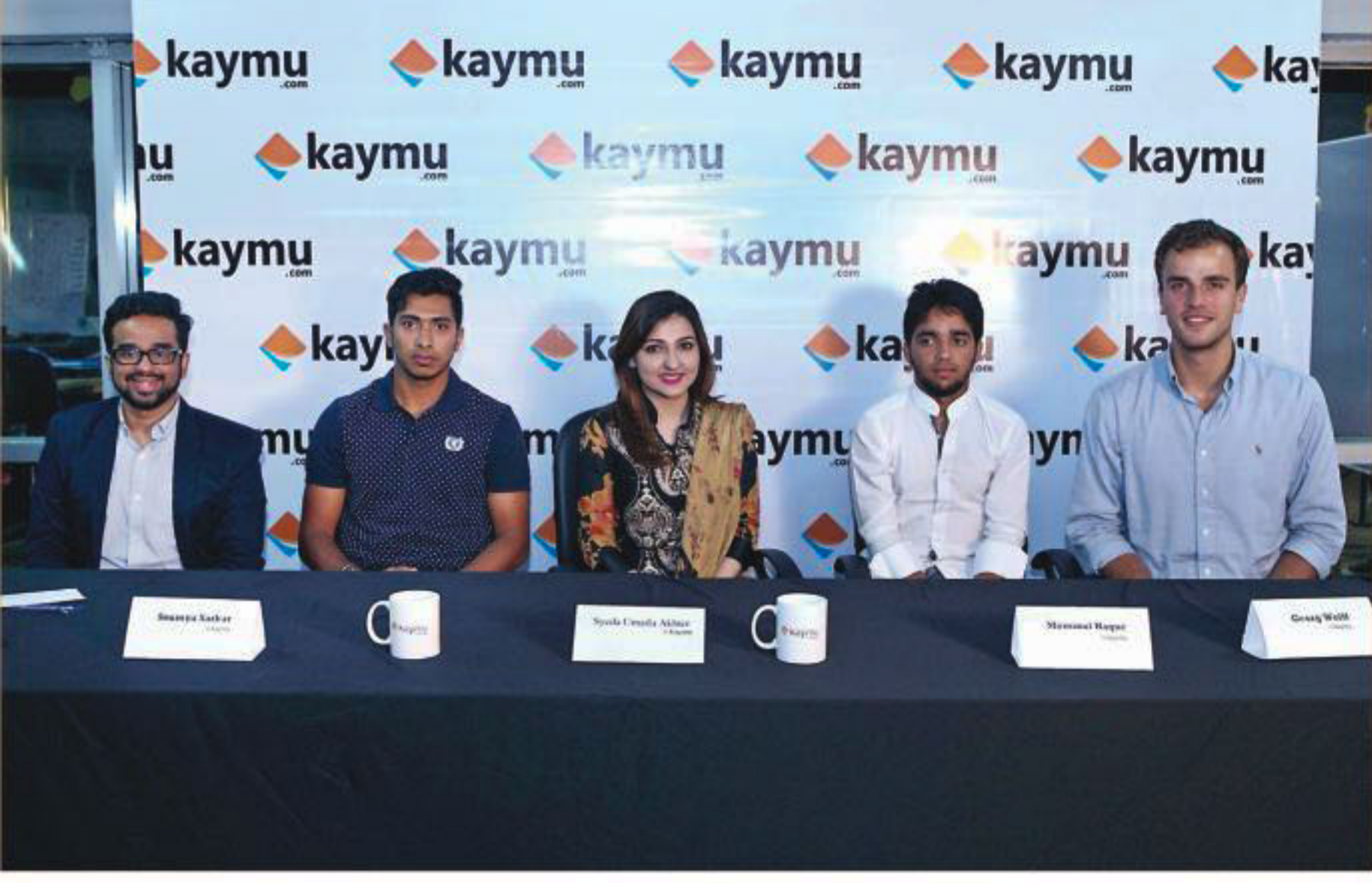
Bangladesh cricket stars Soumya Sarkar (2nd from L) and Mominul Haque (2nd from R) become brand ambassadors for Kaymu Bangladesh Limited during a ceremony at their office in Banani on Sunday.

"This is good for Brazilian football as a whole, having a player scoring in the final and winning the Champions League," Dunga said.