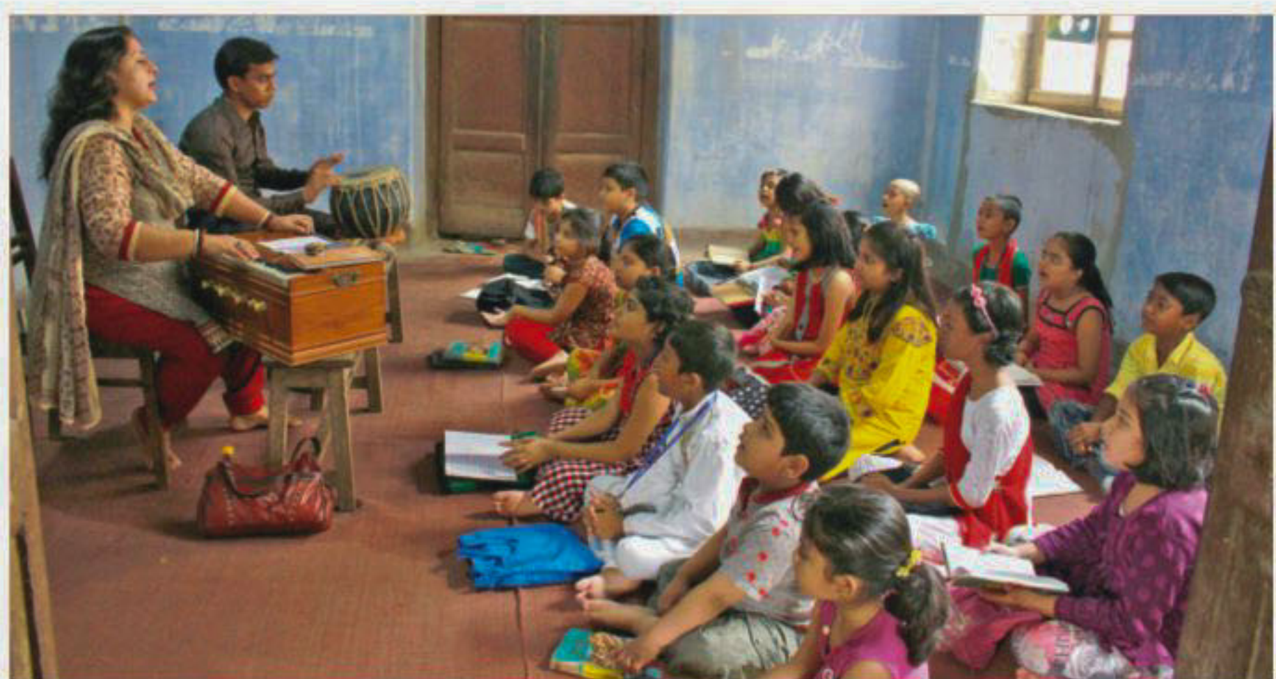
(Clockwise from top left); The magnificent architecture of BAFA building in Waizghat; children in a music class, and students take painting lessons from instructors.

The reputed cultural school is celebrating its diamond jubilee today (June 10) with a grand programme at Abdul Karim Sahitya Bisharad auditorium of Bangla Academy at 3:30pm. Cultural Affairs Minister Asaduzzaman Noor will be present as chief guest while advocate Kazi