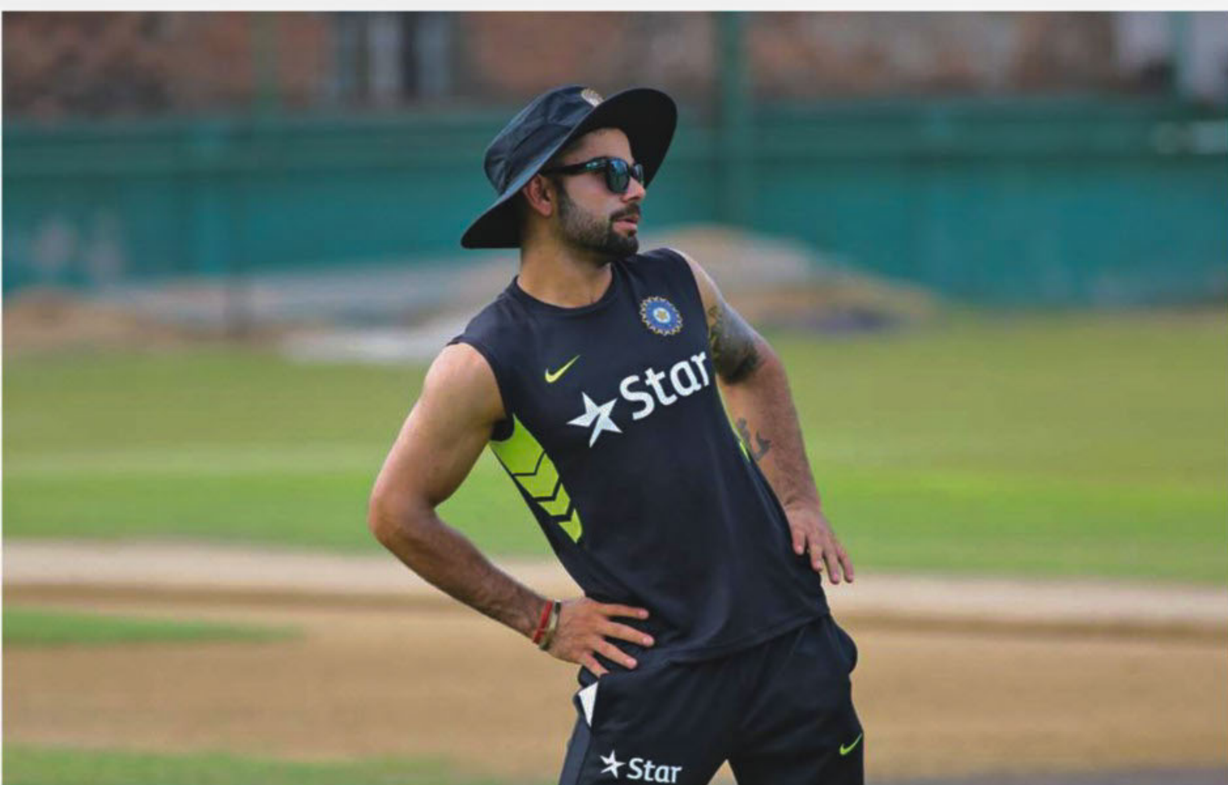
India Test captain Virat Kohli (left) looks relaxed as he limbers up at the BCB Academy ground in Mirpur while his Bangladesh counterpart Mushfiqur Rahim (extreme right) is having a close look at the Fatullah wicket along with coach Chandika Hathurusingha yesterday.