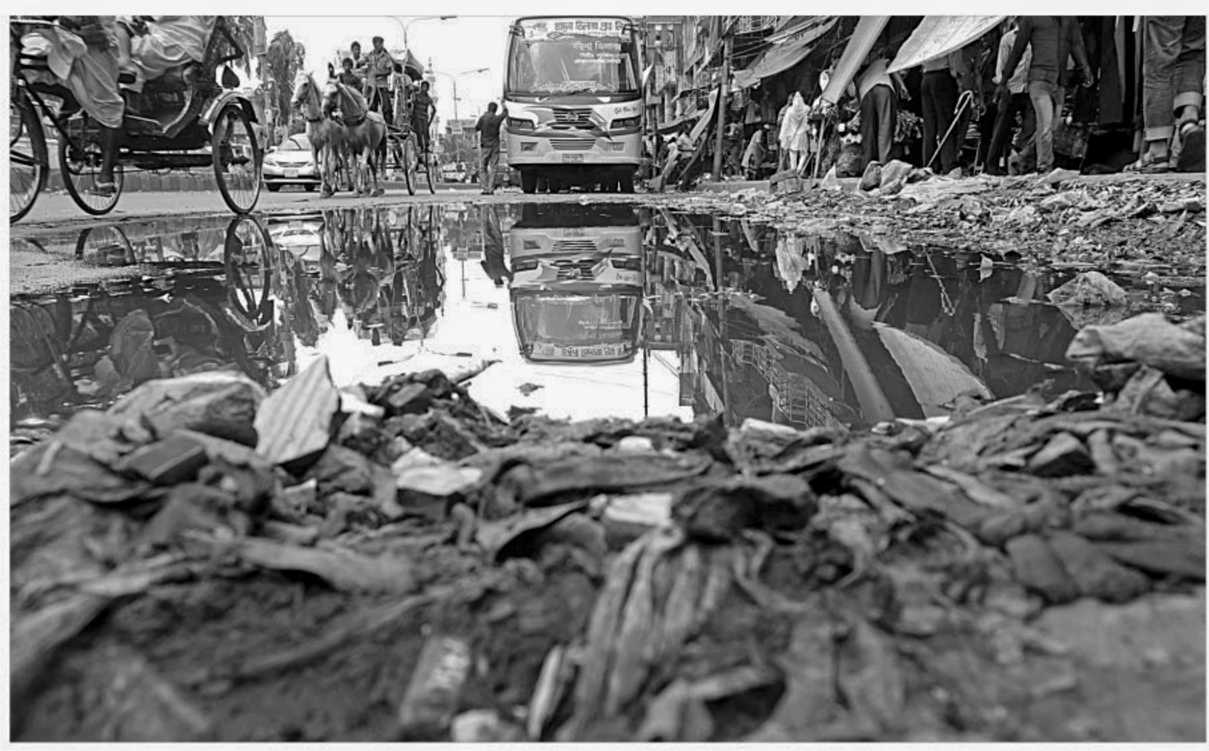
Rainwater collects in a large crater, surrounded by construction waste and discarded materials, near the capital's Fulbaria bus terminal, making it immensely difficult for vehicles to pass through the area smoothly and without causing a tailback. The photo was taken on Wednesday.

Teachers of different public universities in five districts observed two-hour work abstention protesting against the proposed 8th national payscale and demanded a separate one yesterday. Termining the proposed payscale "disgraceful and discriminatory" for university teachers, Dhaka University Teachers' Association staged a sit-in at the historic Bat-tala of the university after the work abstention. Teachers under Rajshahi University Teachers' Association held a protest rally after the work abstention in front of the senate bhaban. Meanwhile, teachers' associations in Sylhet Agricultural University, Begum Rokeya University in Rangpur, and Chittagong University also observed the work abstention. The protest programme was observed as per the decision of the Federation of Bangladesh University Teachers' Association (FBUTA), taken on Friday.