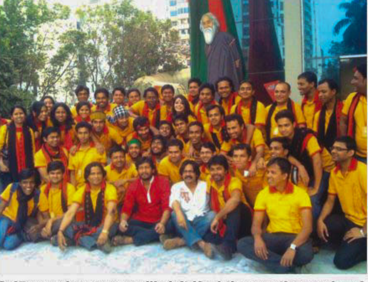
A 45-member group will visit Kushtia over the weekend.