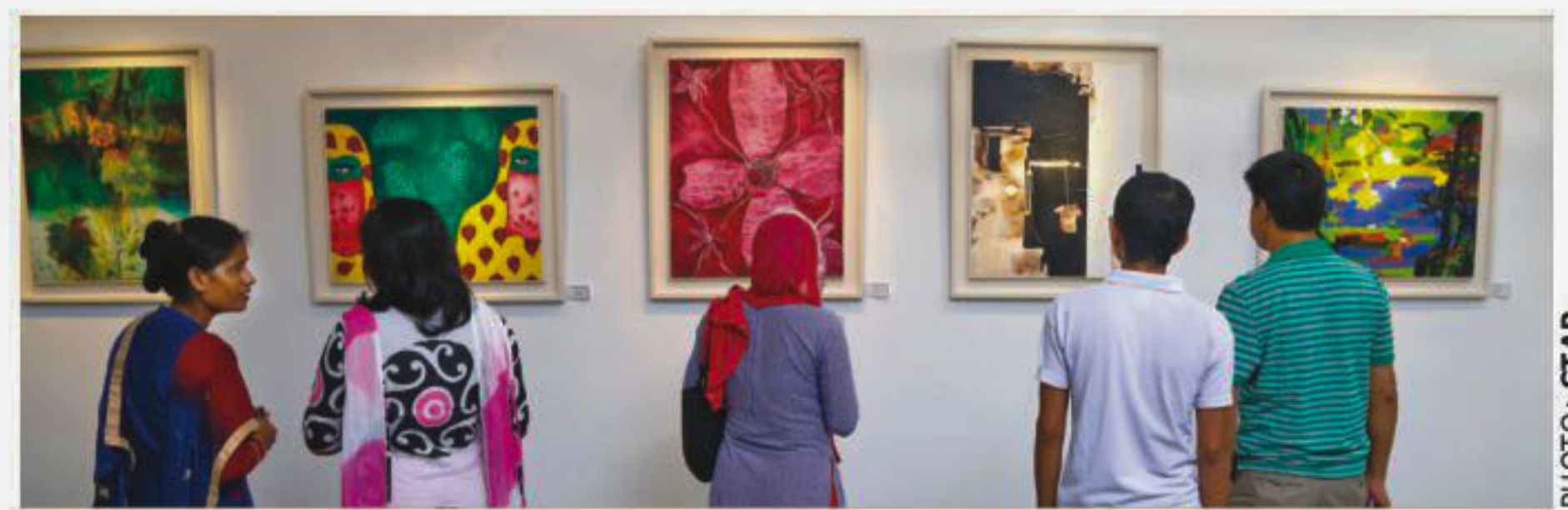
Guests inaugurate the exhibition (top); visitors browse the artworks.