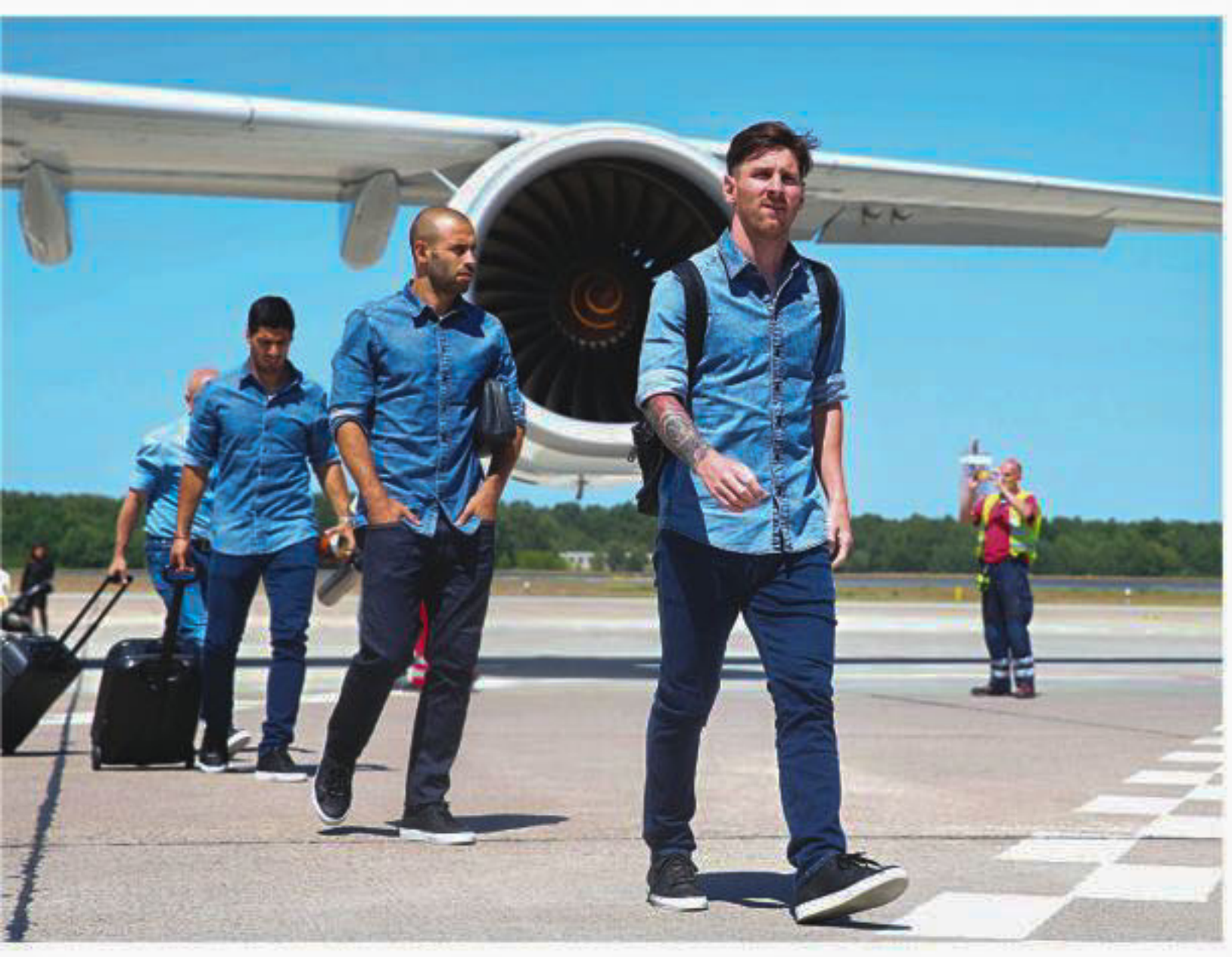
Barcelona superstar Lionel Messi (L) leads his teammates out of the plane in Berlin while Juventus' midfield maestro Andrea Pirlo already gets (R) down to business at the city's Olympic Stadium yesterday ahead of tonight's UEFA Champions League final.

Messi destroyed Guardiola's Bayern Munich with two goals in the first leg of their semifinal before setting up Neymar for the third at the Camp Nou.