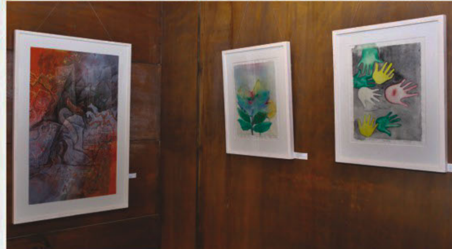
Artworks on display at the café.