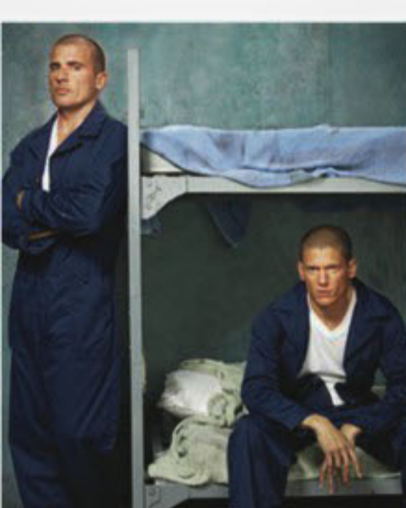
Both Miller and Purcell

have stayed busy since the cancellation of "Prison Break": Miller has appeared in a bunch of movies, even writing the script for Park Chan-wook's English-language debut "Stoker". Purcell has filled his time appearing in a ton of low-budget action movies where he generally plays gruff tough guys.