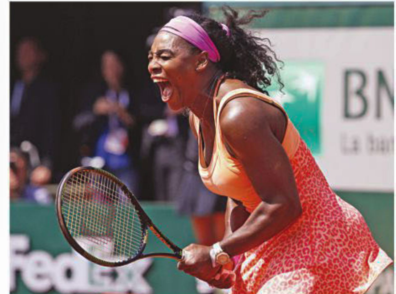
Serena Williams roars in celebration after beating Sara Errani in the French Open quarterfinals in Paris yesterday.

Bacsinszky is through to her first Grand Slam semifinal after repelling a battling performance by Van Uytvanck on Court Suzanne Lenglen in a match that lasted an hour and three quarters.